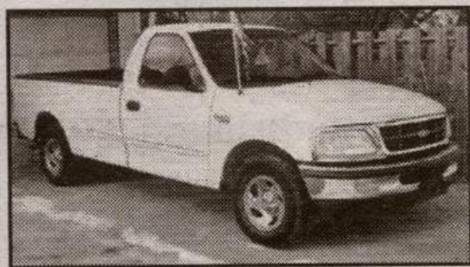
1998 F150 XLT