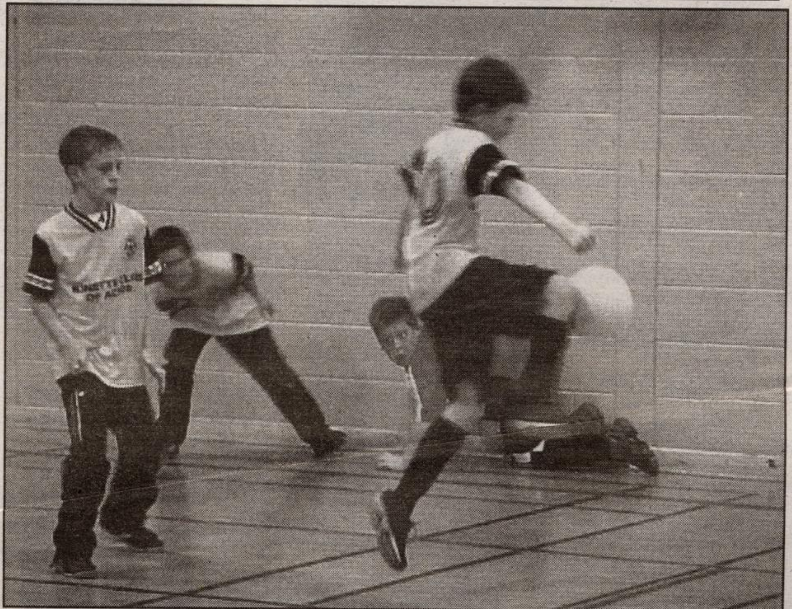
SLICK SOCCER: Faced paced action is all part of indoor soccer. You can catch the free games in the gym at McKenzie Smith Bennett on Saturdays