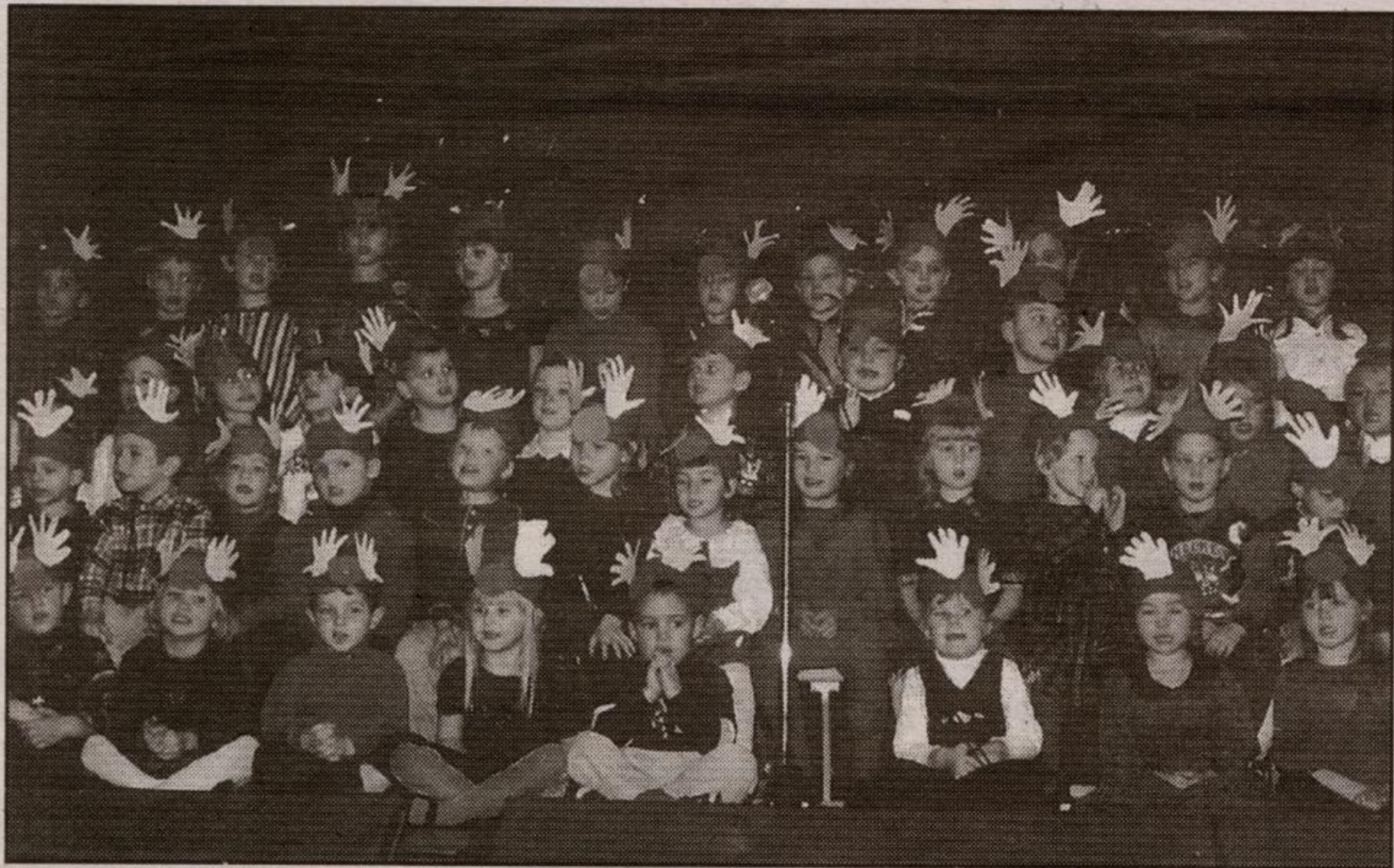
RUDOLF WANNABES: The Junior and Senior Kindergarten classes at McKenzie-Smith Bennett School thrilled their proud parents and a standing-room only crowd at their Christmas concert last Tuesday.