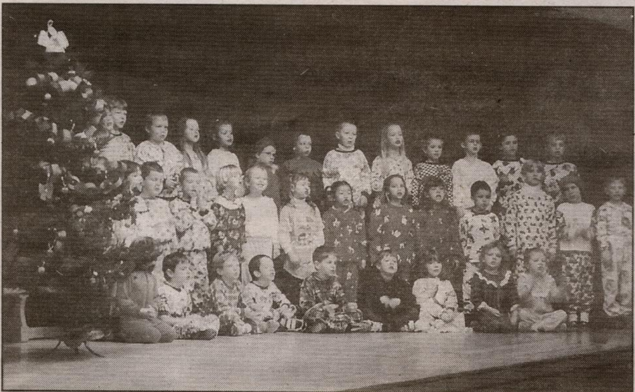
PYJAMA PARTY: Grade ones at Robert Little school sing sweetly for parents and friends at the school's Christmas concert on Wednesday, Dec. 19 the school auditorium.