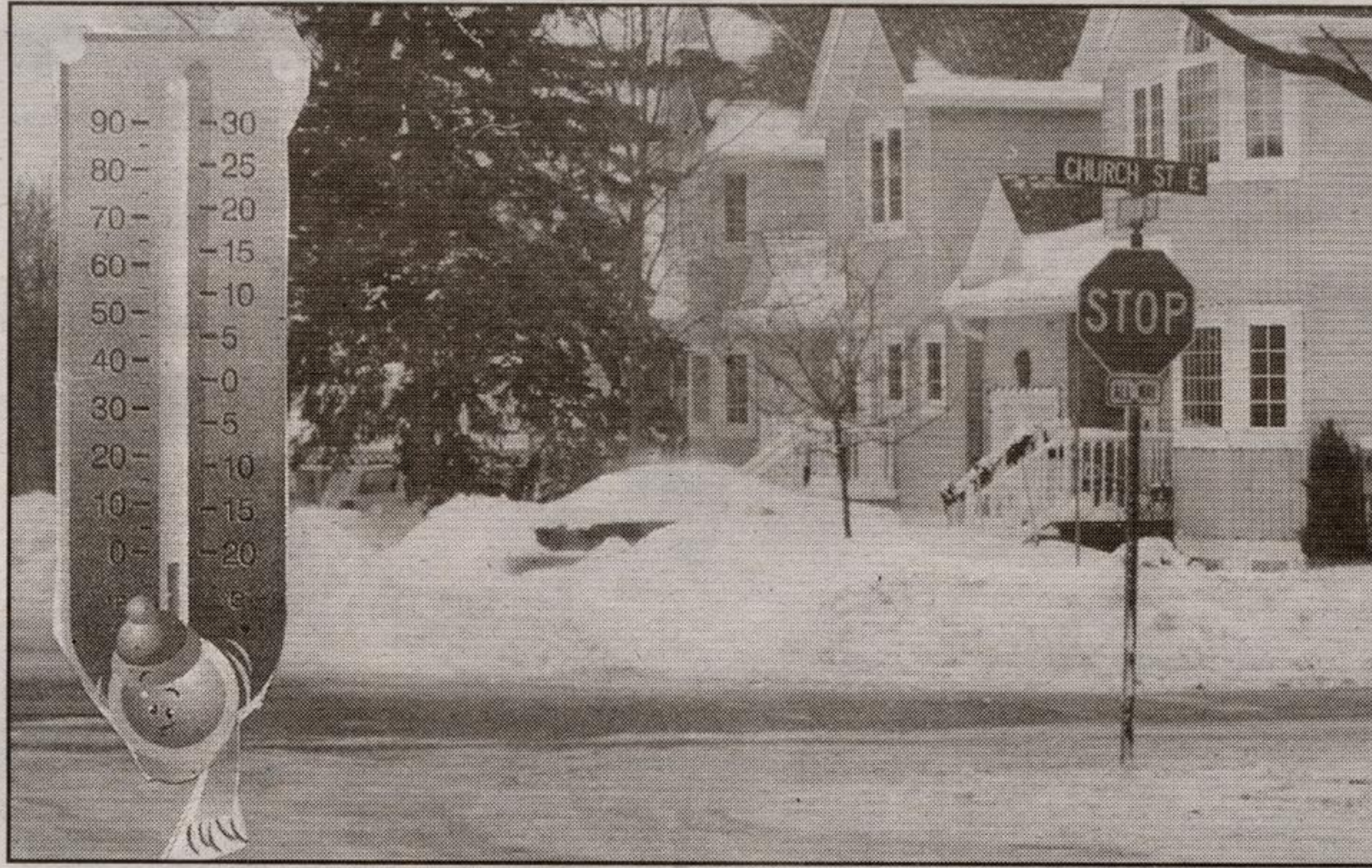
JANUARY: The coldest temperatures in a decade and twice the usual amount of snow leaves Acton shivering and shovelling.