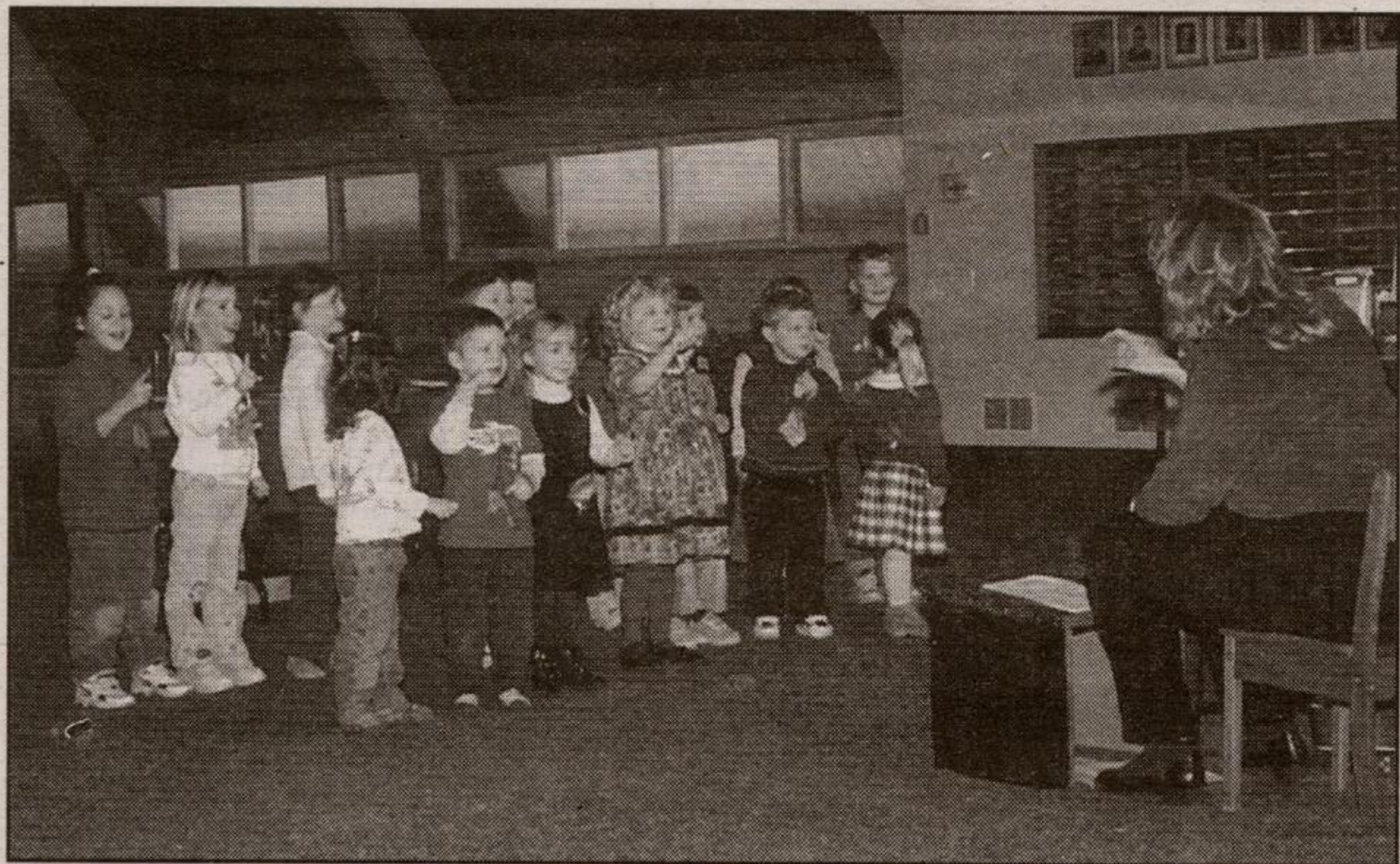
STORY HOUR: Children from the Story Hour program at Beth-El Christian Reformed Church entertain the ladies of Acton Coffee Break after they packed hangers for the needy last week.