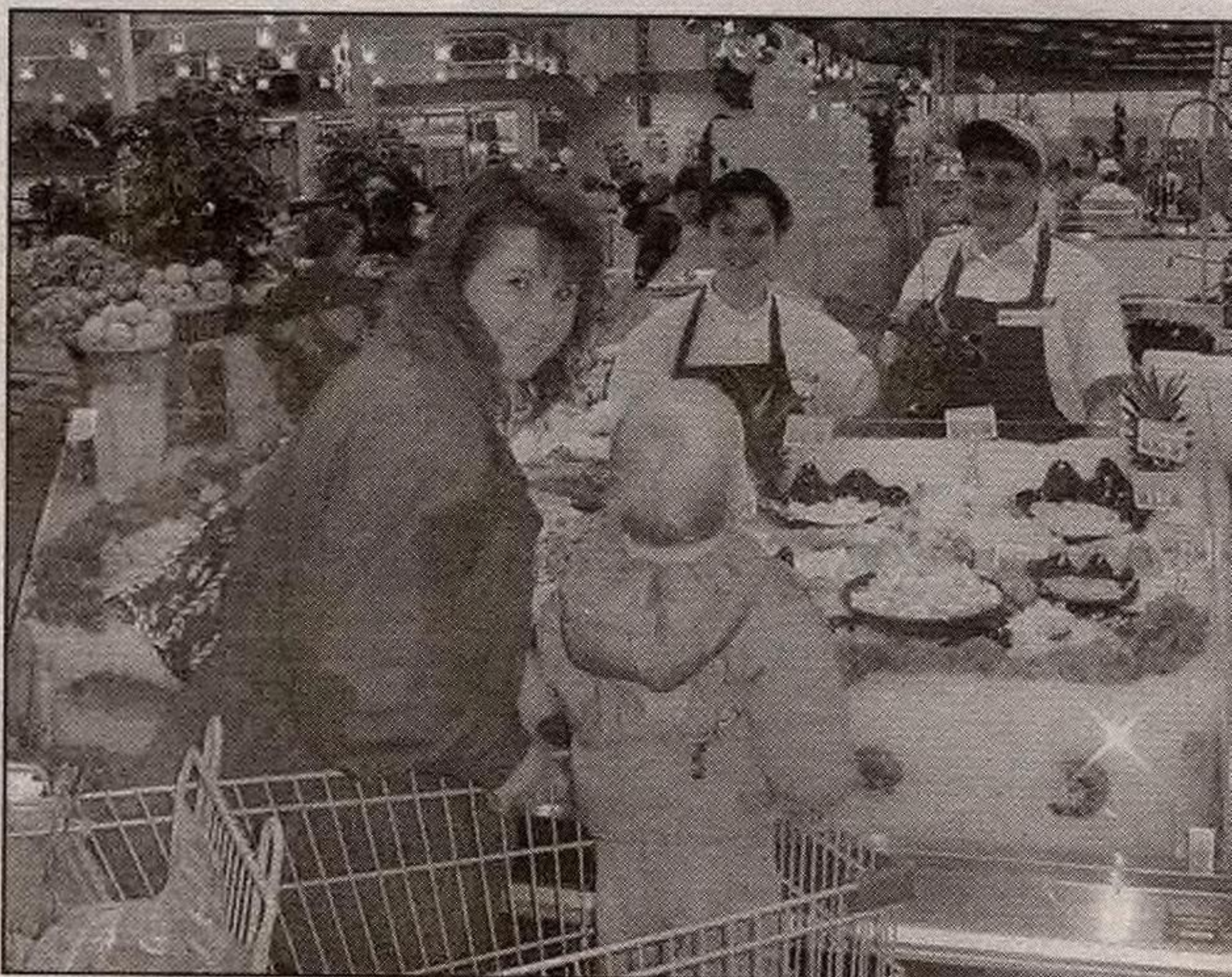
OPENING DAY: Throngs of shoppers crowded into the new Garden Market IGA for the opening last Thursday morning. Staff at the delicatessen counter greet one of the many people who are shopping at the new store.