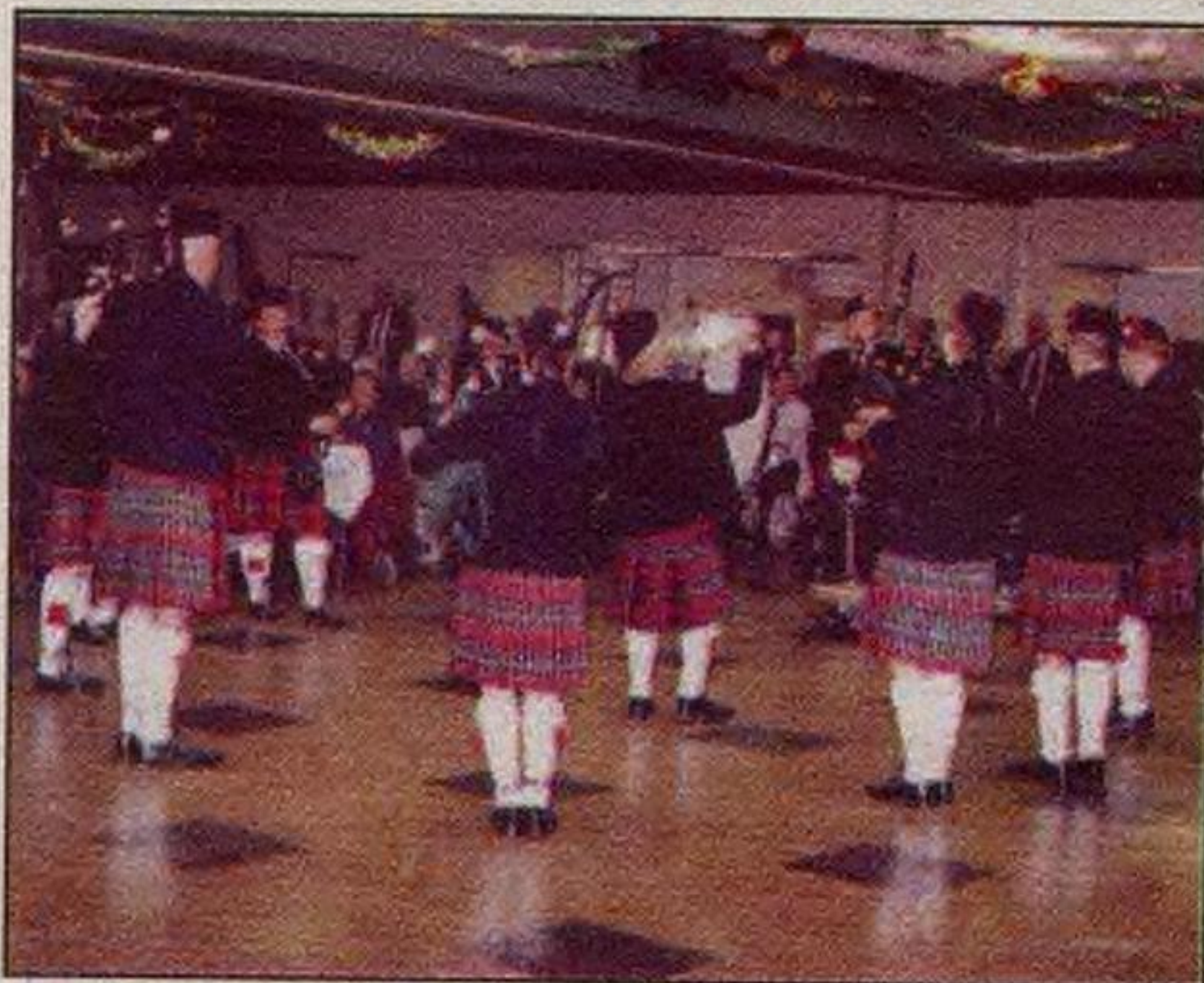
PIPED MUSIC: Georgetown Pipe Band were the guest artists who entertained Seniors at the annual Rotary/Legion Christmas dinner at the Legion.