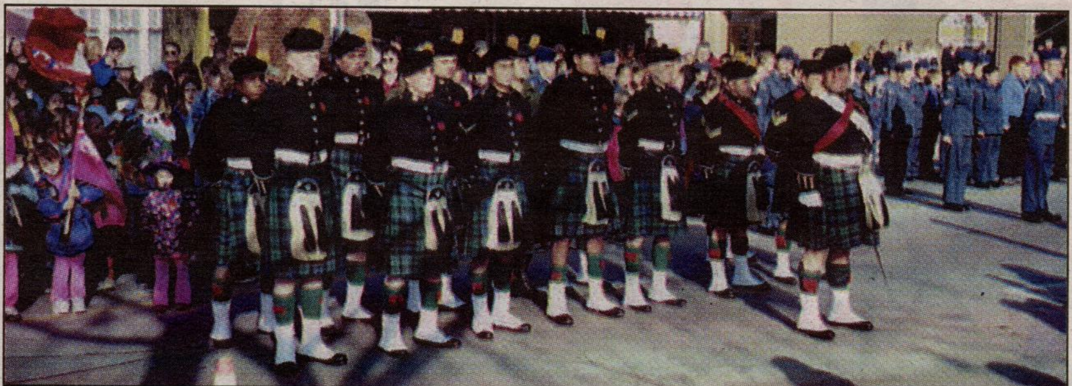
'C' Company of the Lorne Scots on parade.