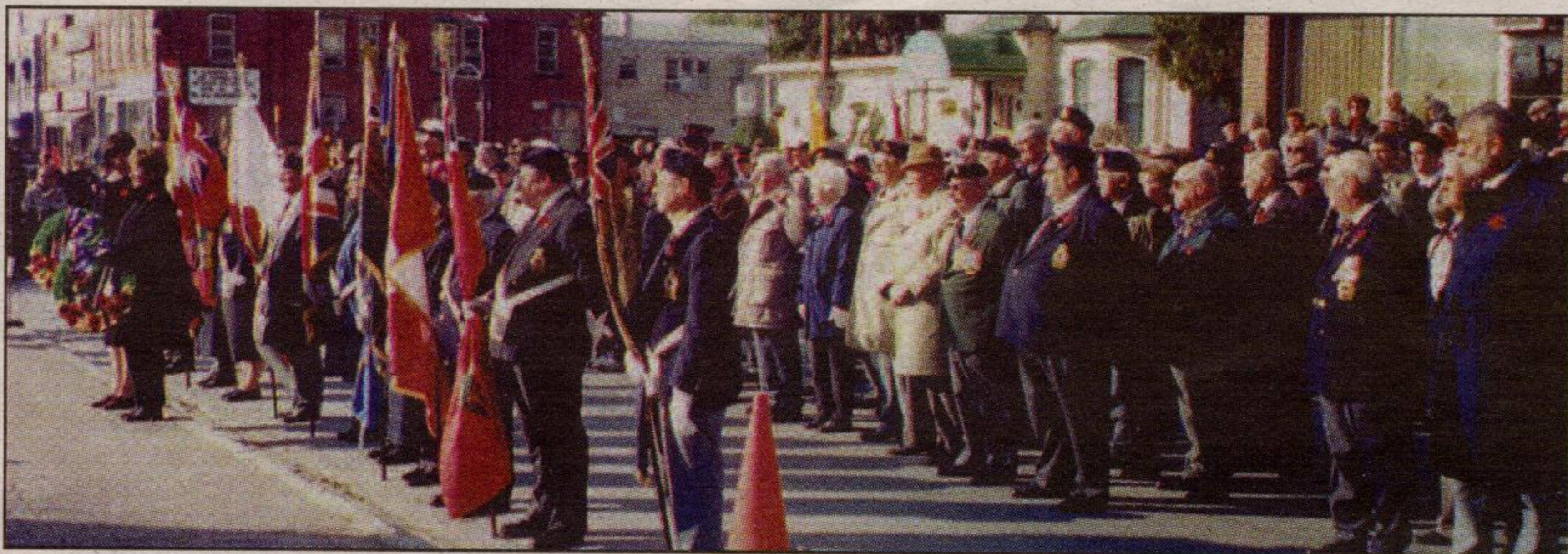
Hundreds were at Remembrance Day services on Saturday.