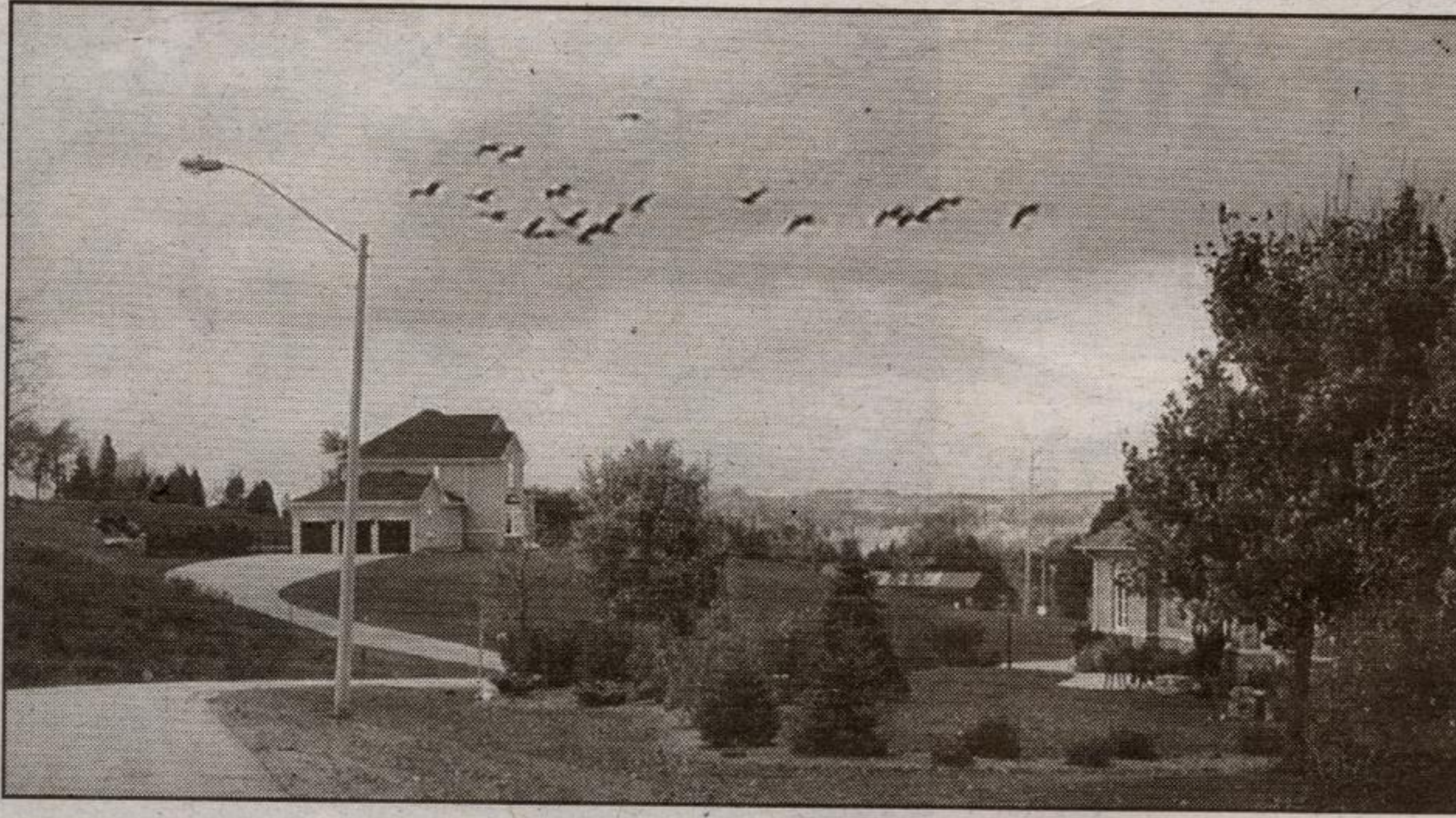
SOUTHWARD BOUND: No! These local geese are just passing through Acton in search of a new feeding ground.