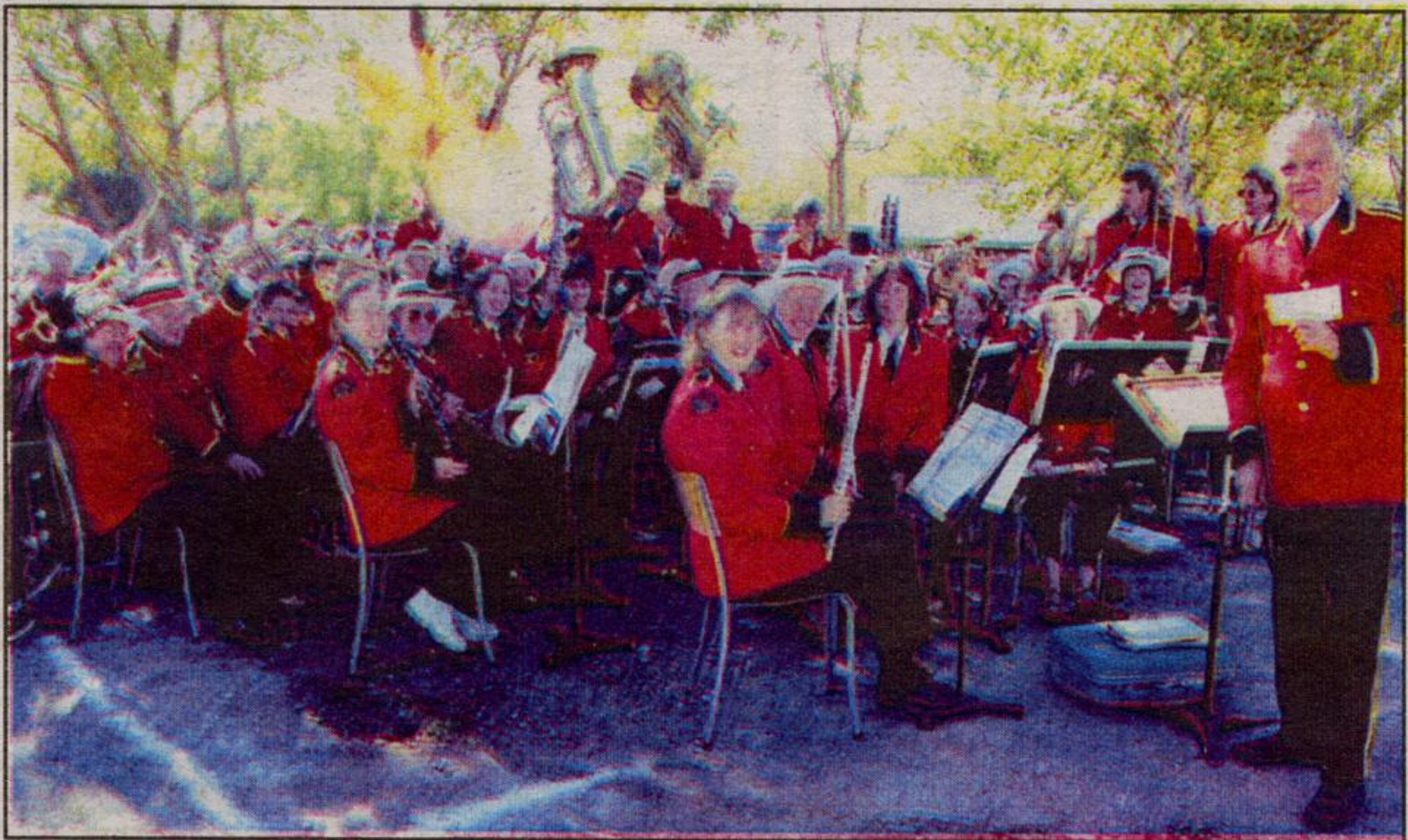
HIP HIP HOORAY: The Acton Citizens' Band closed the Trunk Sale season with a concert of marches and other favourites. Following their performance, the Trunk Sale presented the group with another $500 donation.