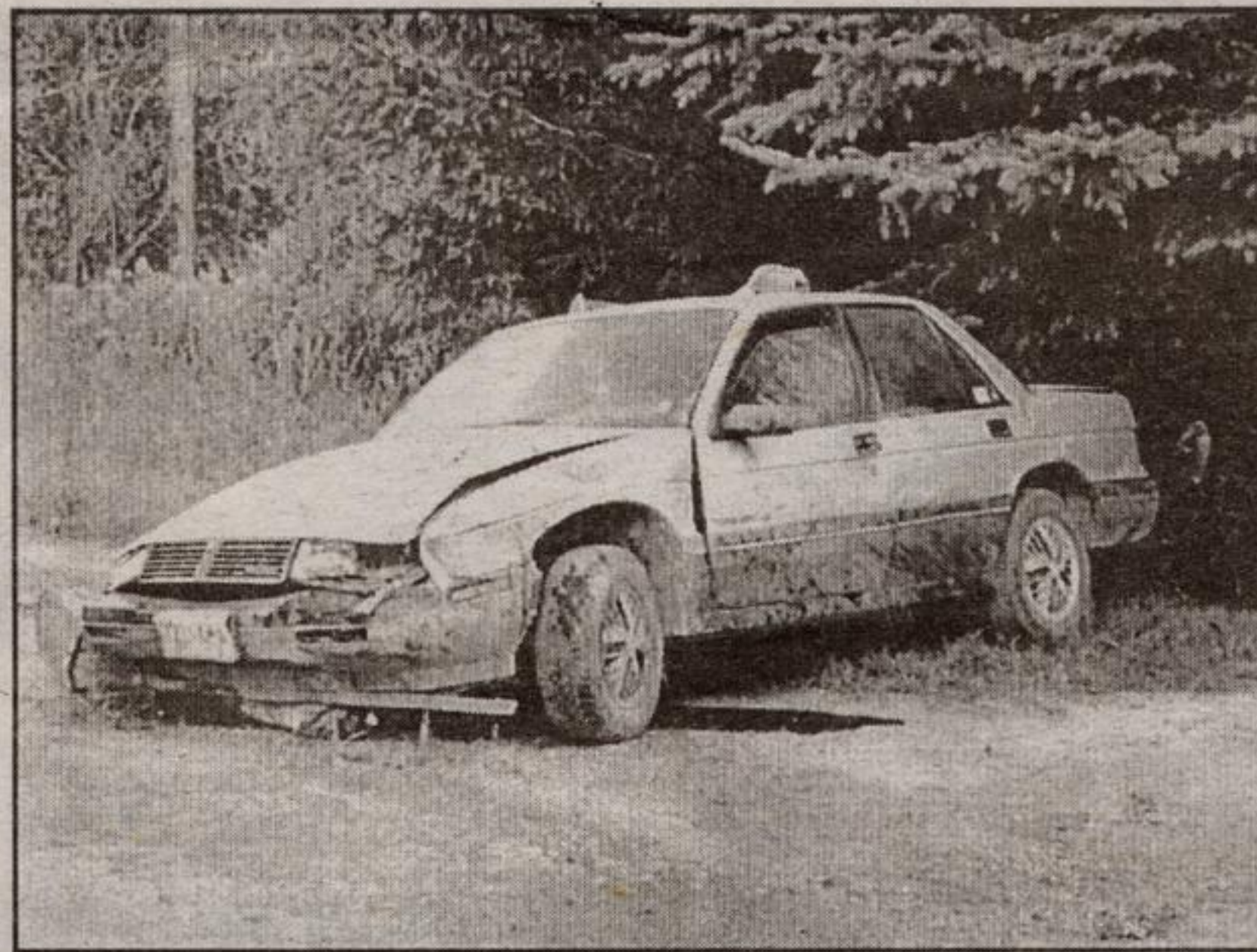
RUDE AWAKENING? The driver of this Tempest sat shirtless and bleeding from minor cuts in the back of a police cruiser on Monday morning while police investigated how he rolled his car, snapping off a mailbox on the Fifth Line, south of Highway 7, just after 8 a.m. The young, male driver refused to identify himself to anyone but police who said he might have fallen asleep.

In Celebration of Our 8th Anniversary We have Reduced Vendors Fee to $5 Vendors • 8 a.m. – 1 p.m. Buyers FREE • 8:30 a.m. – 12:30 p.m.