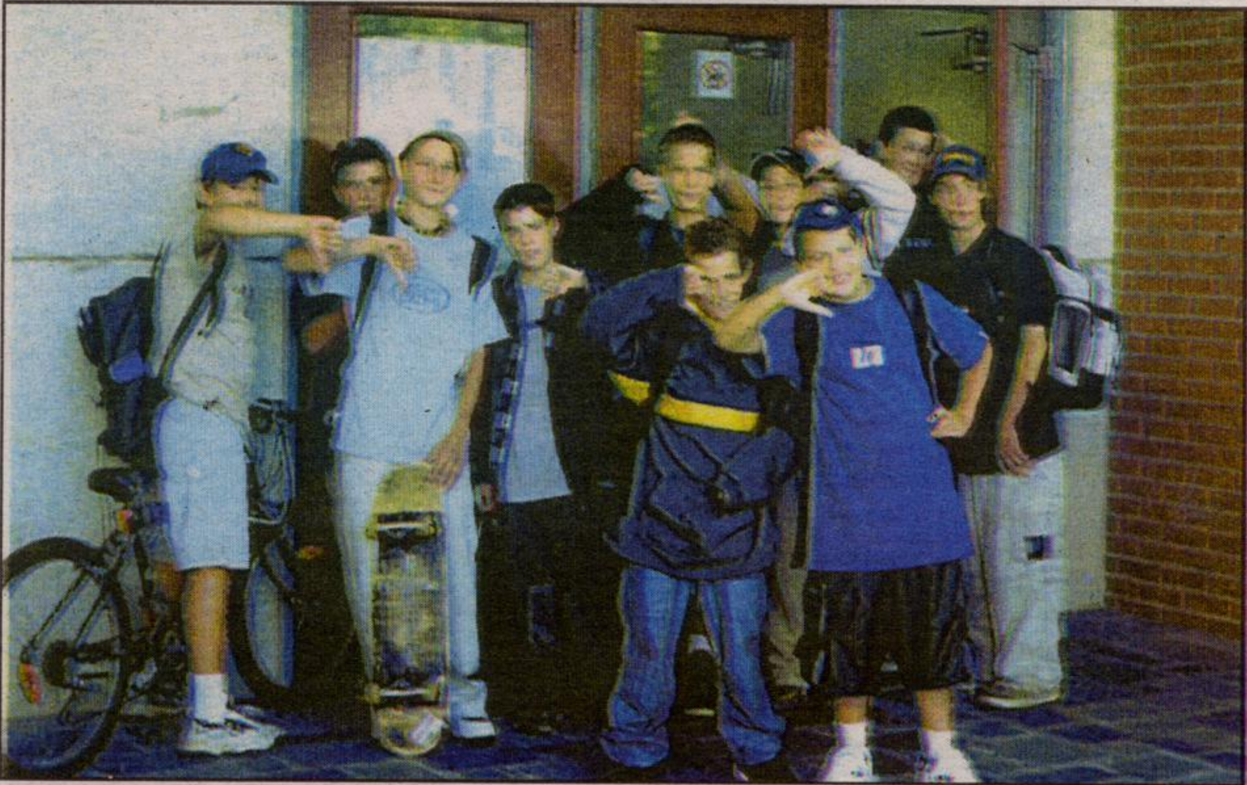
SUMMER IS OVER: Some McKenzie-Smith Bennett School students shared the same sentiment when asked if they were ready and willing to begin a new school year on Tuesday.