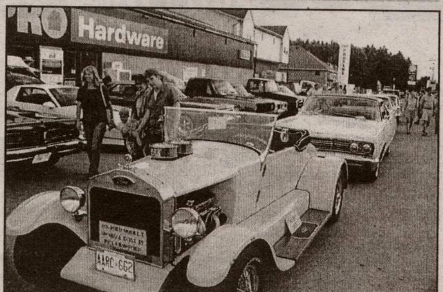
FAST FUN: Some cars are classics, some are pure fun. You can see a wide variety of vehicles at the monthly cruise night in Rockwood. Proceeds from the cruise go to the Guelph Make a Wish fund. The last cruise of the summer will be September 22.

Call The New Tanner with your news tips! 853-0051