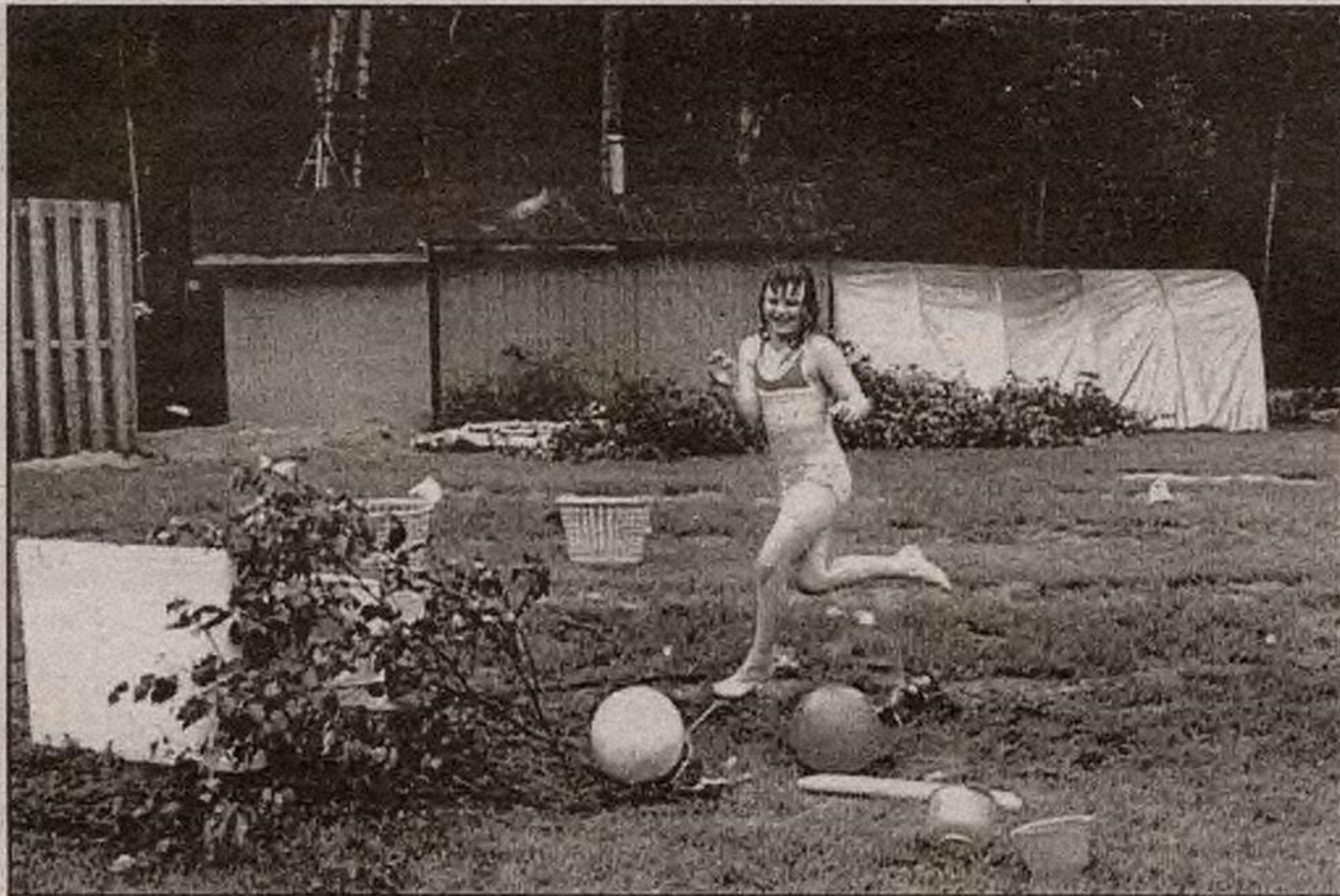
BEATING THE HEAT: This youngster tip-toes through a sprinkler escaping (although momentarily) the extreme temperatures experienced in Southern Ontario recently.

Both appear in Milton court on September 30.