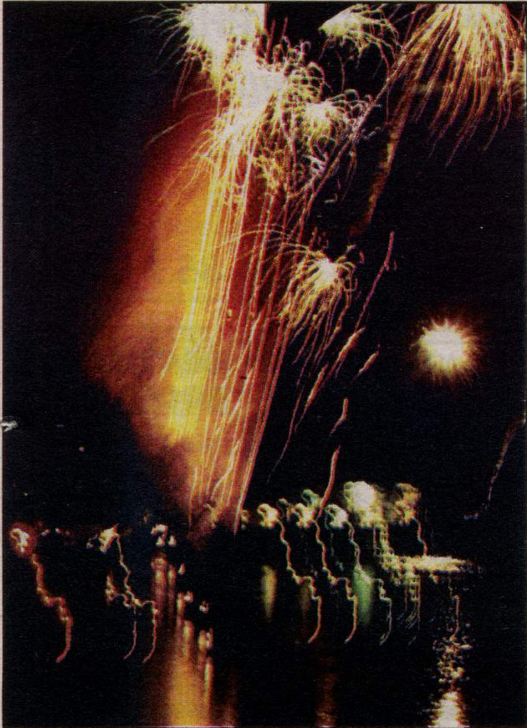
SPECTACULAR SIGHT: Despite plunging temperatures and threat of rain, thousands of spectators lined the banks of Fairy Lake Sunday night for the annual Firefighters' fireworks display. Large crowds were at Prospect Park, Acton Legion, St. Joseph School and along Elizabeth Drive for one of the most spectacular displays ever.