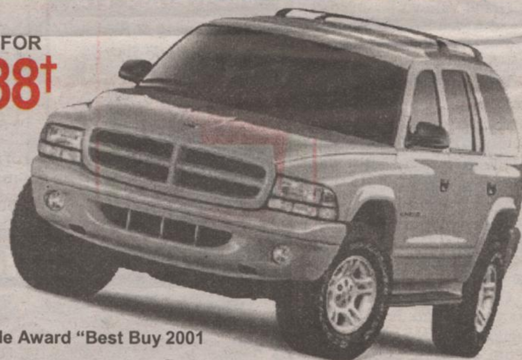
Carguide Award "Best Buy 2001"

• Security system • AM/FM stereo cassette with CD and equalizer