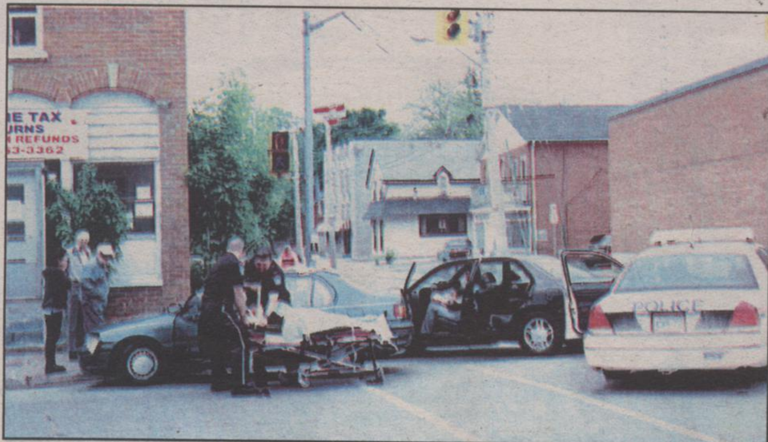
CAR ACCIDENT: Halton Regional Police responded to a car accident that happened at the corner of Main and Mill St., early this morning. Some local residents gathered as paramedics cared for the injured individual. Further information was not available at press time.