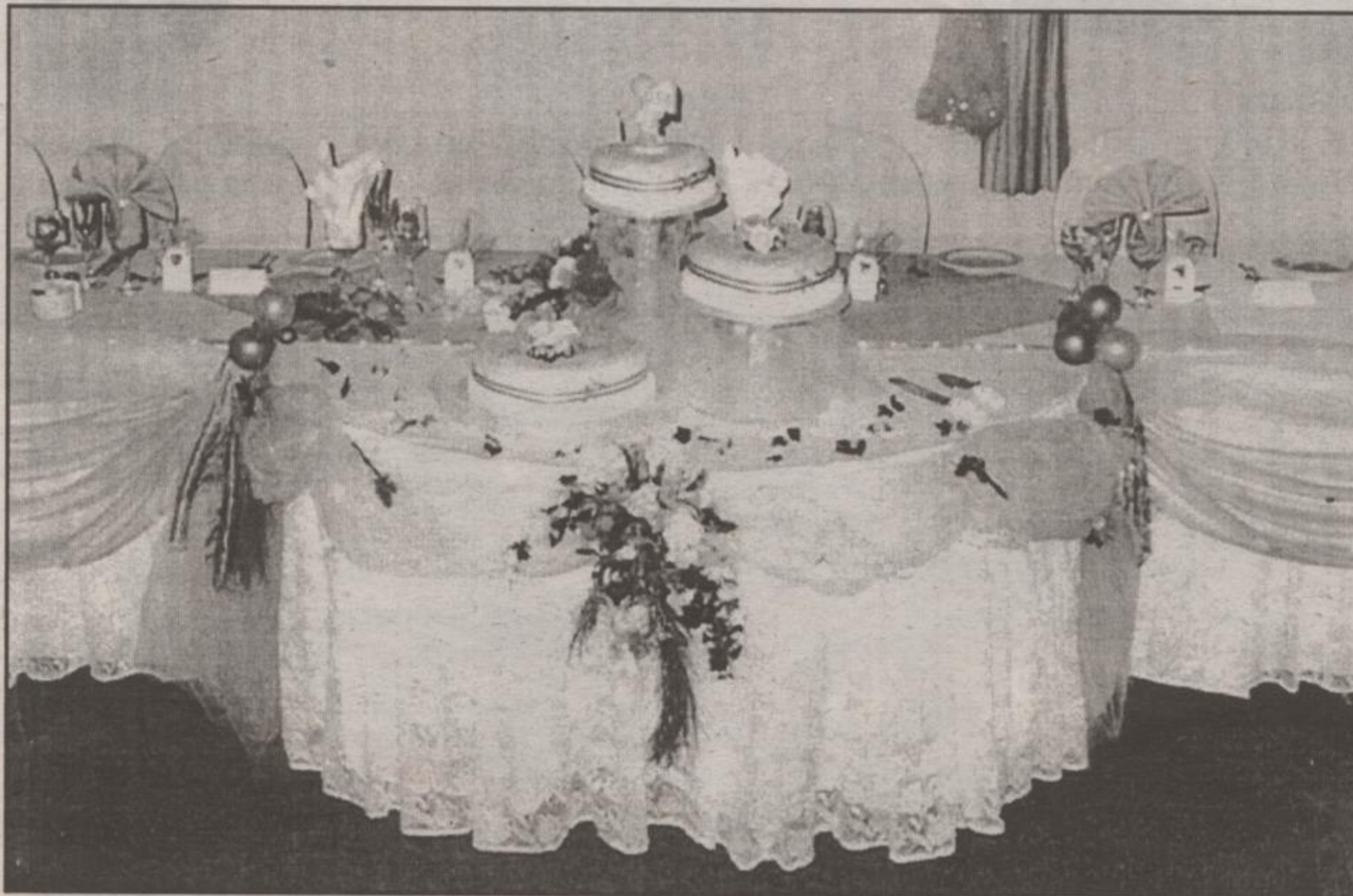
DRESSED FOR A BANQUET: The Grand Chalet dresses up beautifully for weddings or banquets.

DiBiase said they pride themselves on offering com-