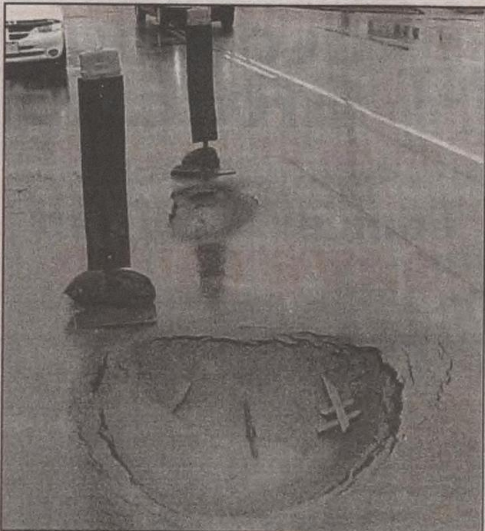
DEFENSIVE DRIVING: These two potholes appeared Sunday evening causing drivers to manoeuvre around them on their Monday commute to and from work.