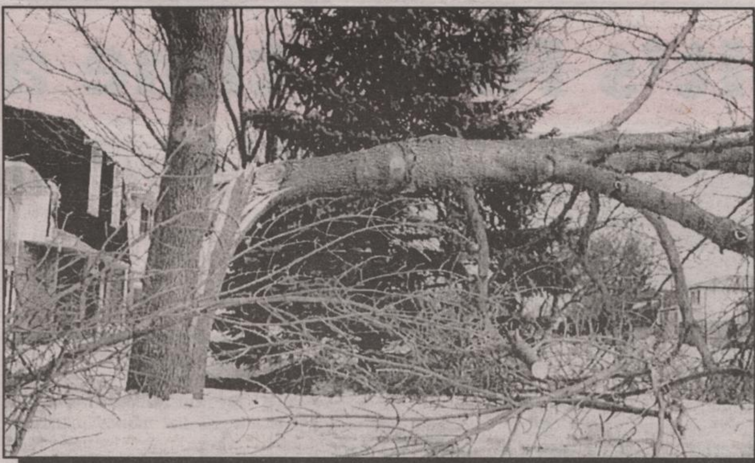
WIND DAMAGE: With a crack one neighbour said sounded like a gunshot, this tree on Norman Avenue snapped in Friday night's high winds. The branch fell across the front lawn, missing the driveway and garage.