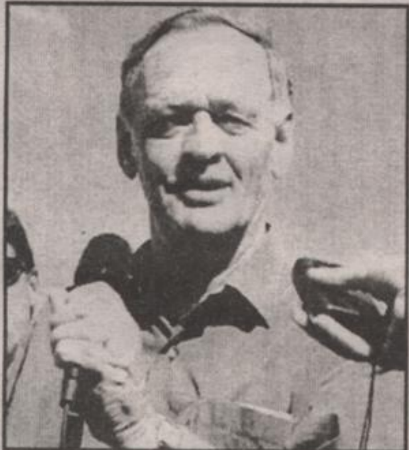
PM visited Polish Scouts at Blue Springs

Over $30,000 is raised for Acton's Susan Lindsay - recovering from a rare brain infection at a US research