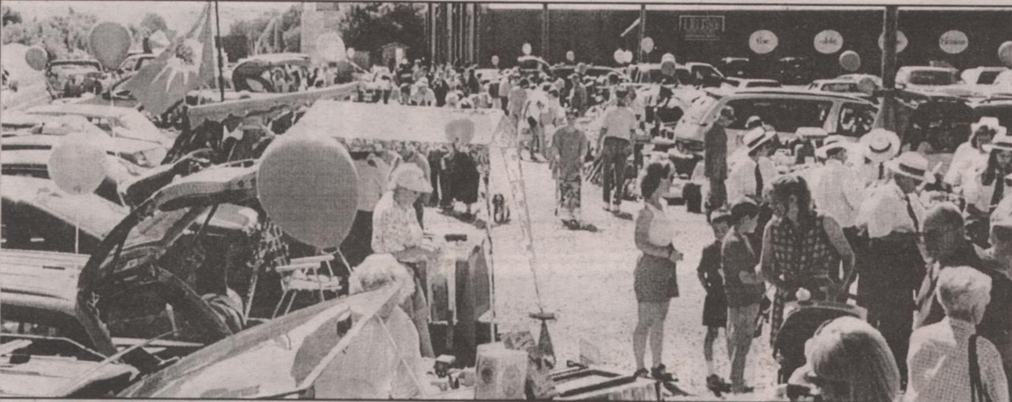
Acton's famous Trunk Sales were bigger in 2000.

Have some news? Let the New Tanner spread it!