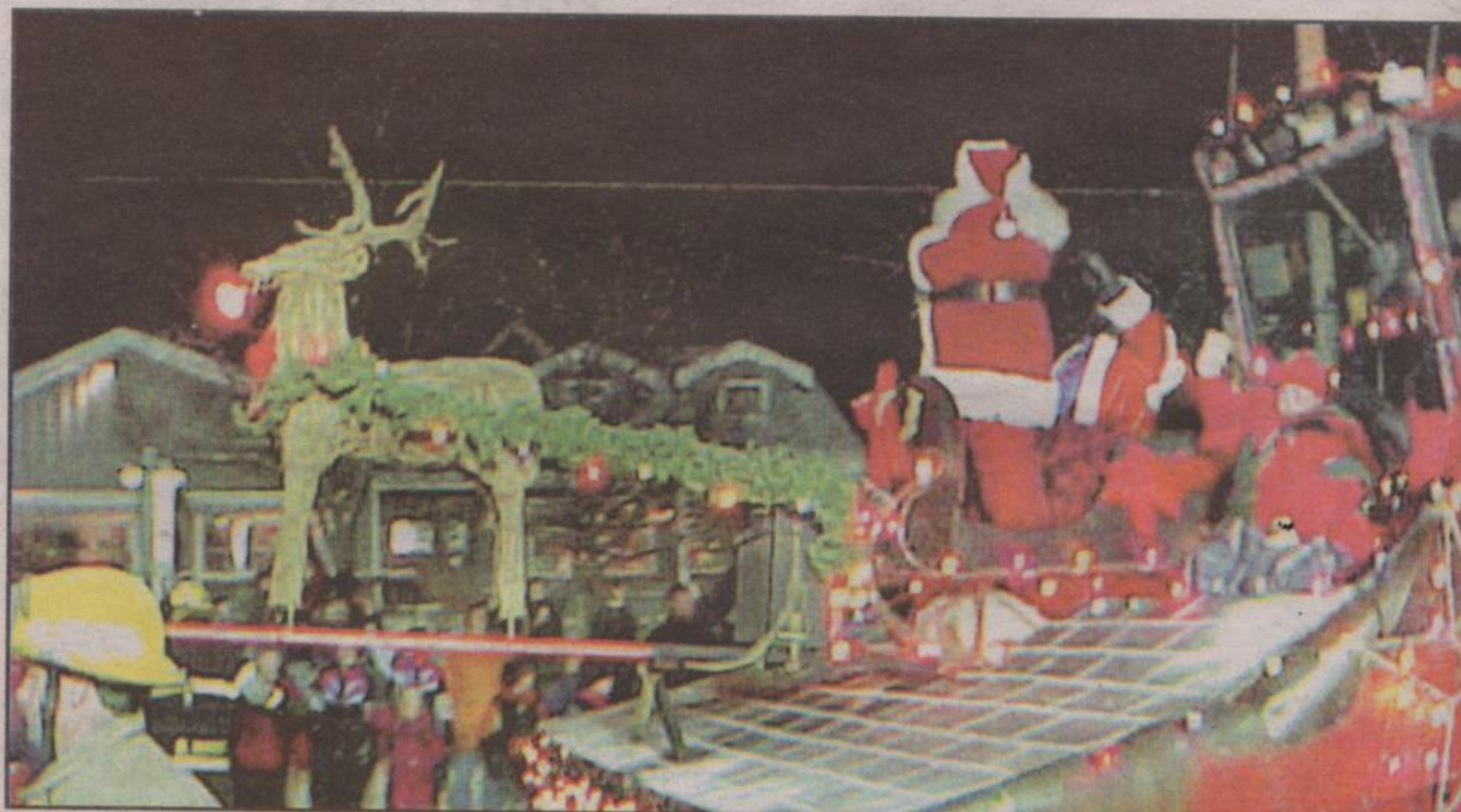
Santa Claus, of course, was the big attraction at the Rockwood Parade of Lights last Thursday evening.