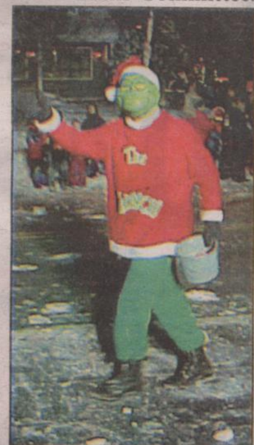
The Grinch that stole Christmas was another popular attraction at the Parade of Lights on December 14th.

Meanwhile the township roads department may apply another coat of gravel as a "bit of a bandaid".