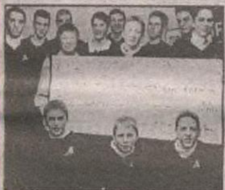
Rotarians had a big one for the Acton Bantams and their trip to Czechoslovakia and Europe. See photo on Page 7.