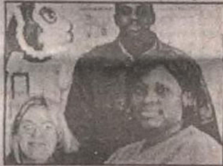
A Mobile Job Centre rolled in Acton this week on wheels. See Page 16 for story.