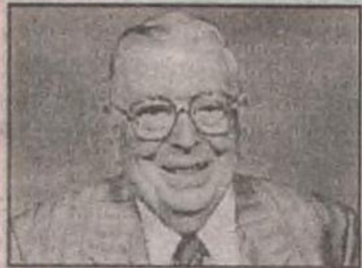
Well know and admired former Acton Councillor died in Guelph. See Page 3