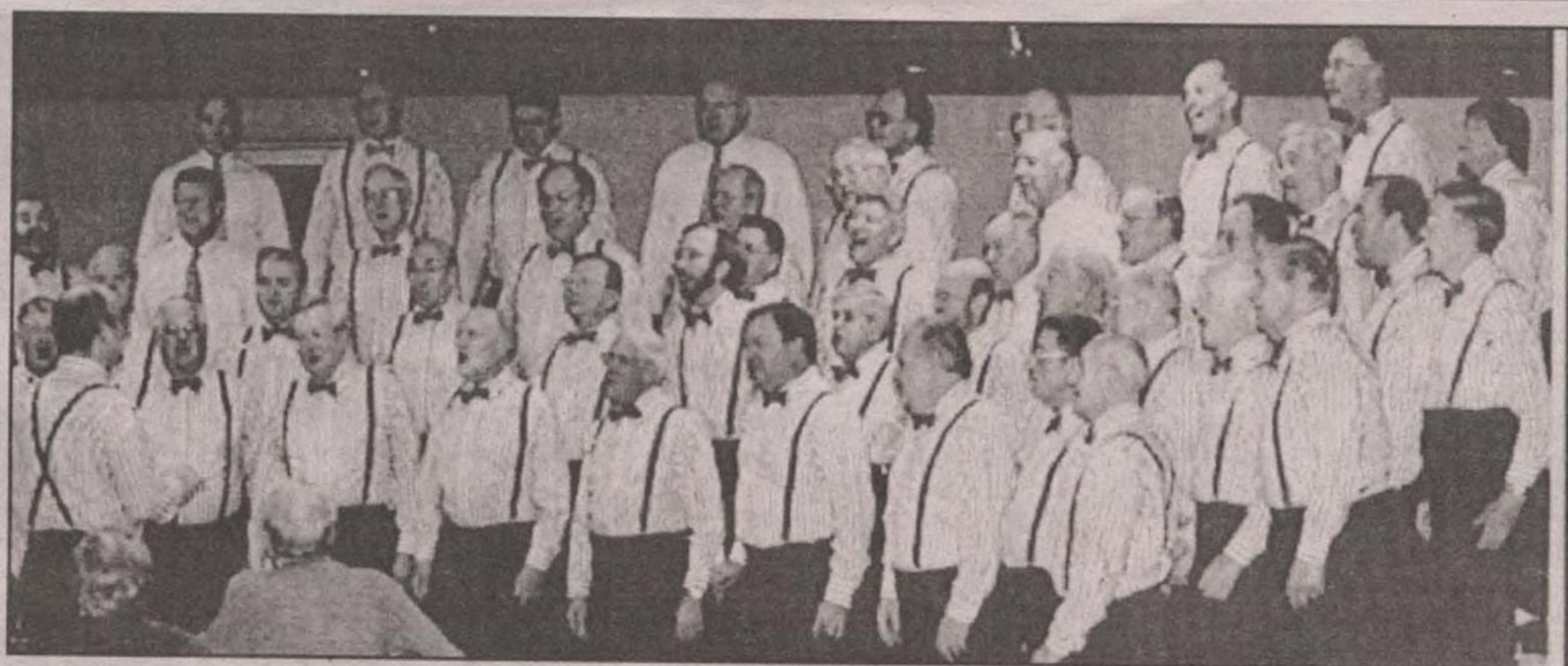
ENTERTAINING ENSEMBLE: The Guelph Royal City Ambassadors entertained at the Seniors' dinner with old favourites and put a new wrinkle on some rollicking songs as well as Christmas songs and carols.