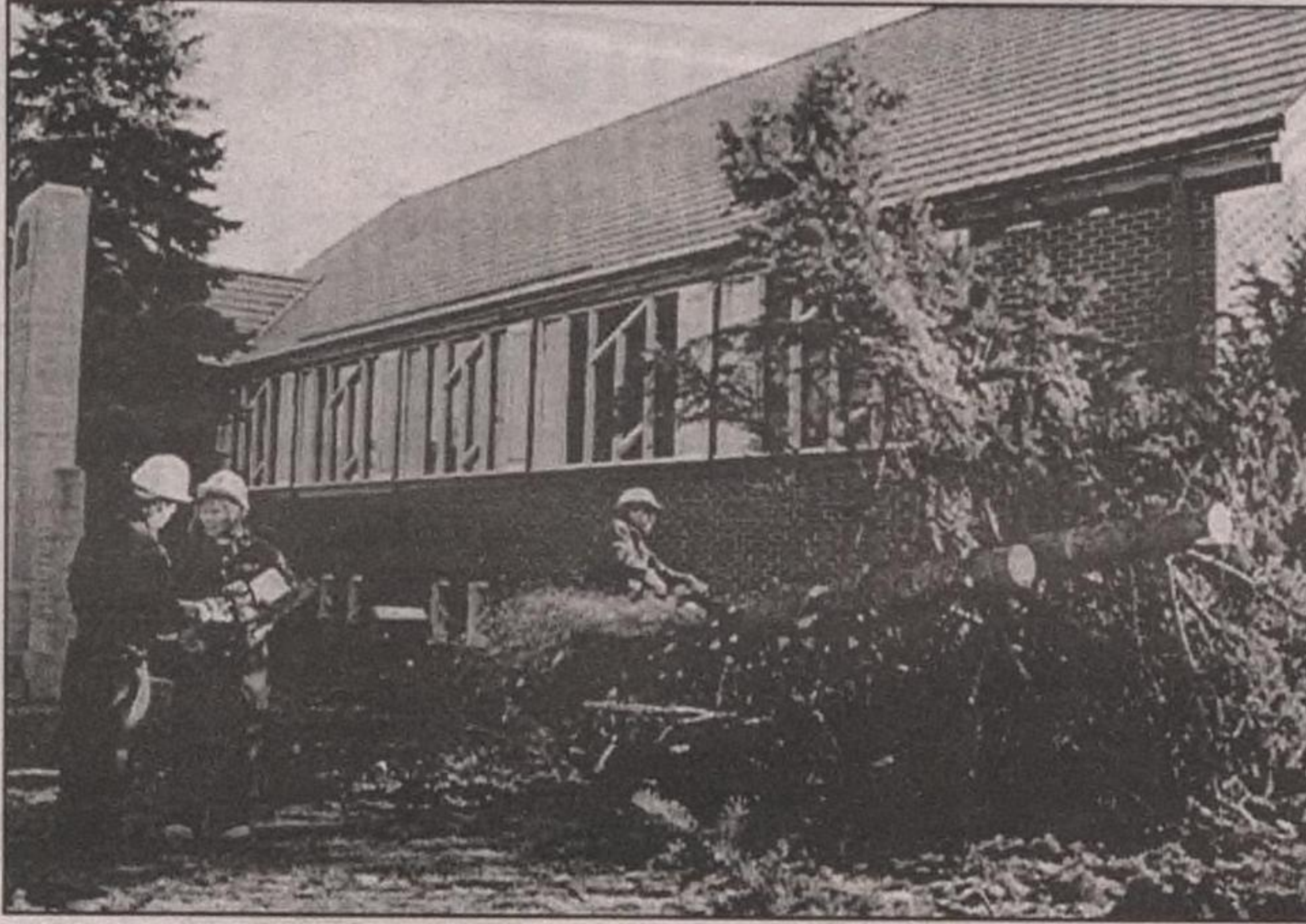
THEY'RE GONE: Halton Hills staff removed the mature spruces surrounding the cenotaph Monday. One tree was diseased and roots from both were encroaching on the United Church basement walls. The Royal Canadian Legion will replace the evergreens with new shrubbery in the spring.