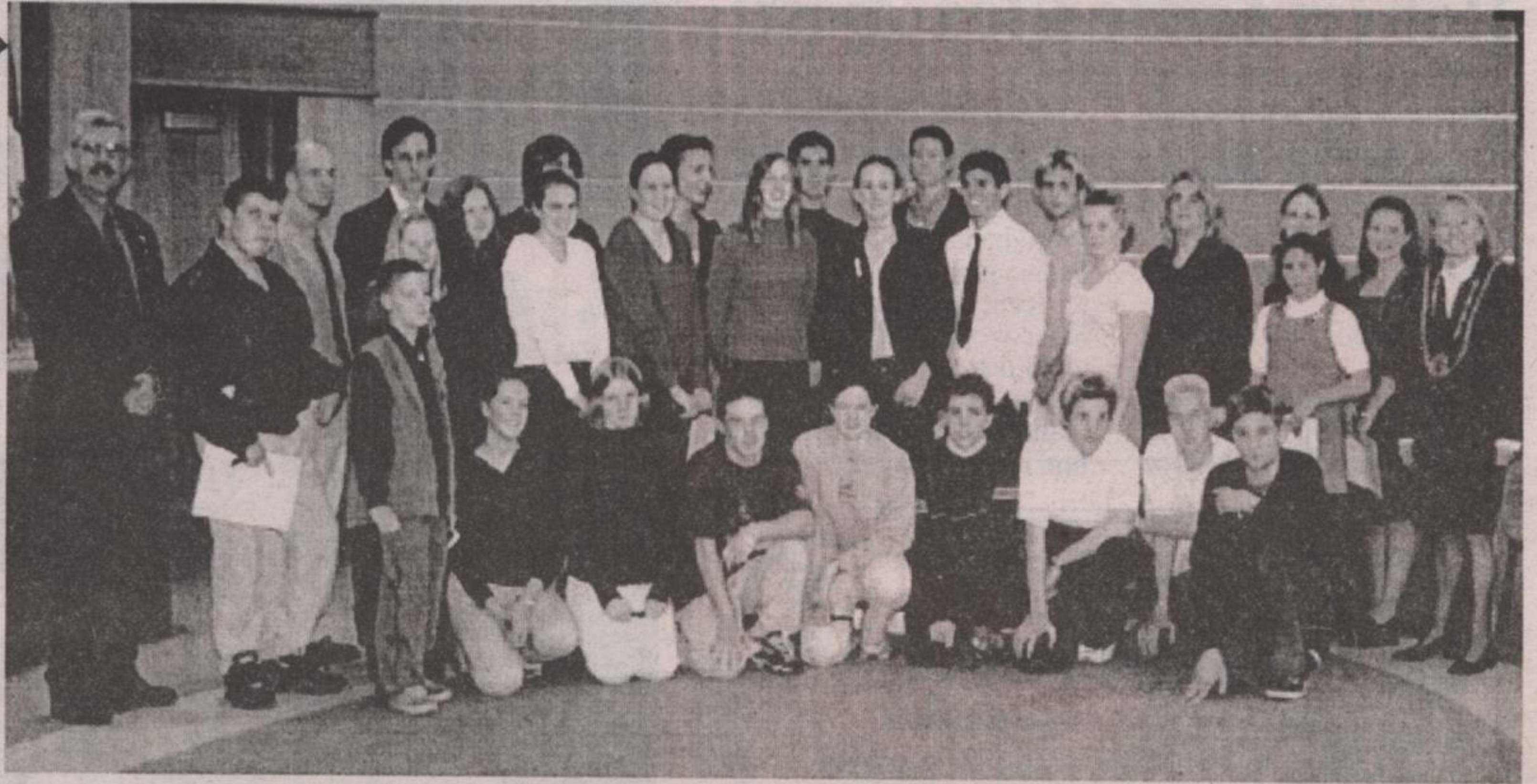
AWARD WINNERS: With their proud families and friends watching, these Halton Hills residents received municipal awards from the Town at a ceremony at the Civic Centre on Monday. Included in the group are five Acton athletes.

Head west on Saturday if you're looking for unique crafts and tasty treats. Rockwood Nursery School is holding its popular annual craft and bake sale at the Town Hall on Main St. South. Doors open at 9:30 and the sales runs until 2 p.m.