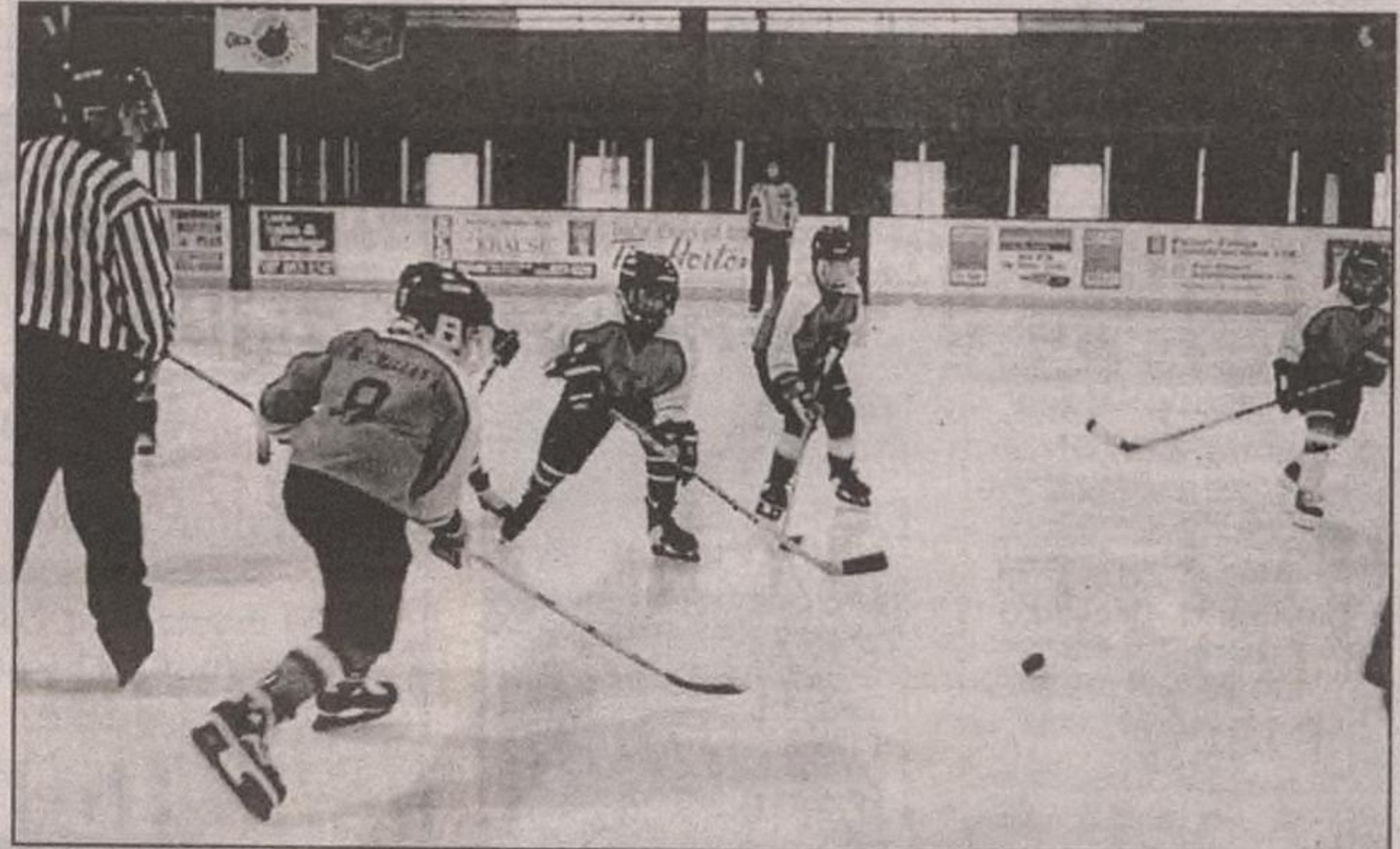
NICE TRY: These MacMillan's players were eager, but unsuccessful as they were blanked 3-0 by Berkshire Group on Saturday in Novice House League play.