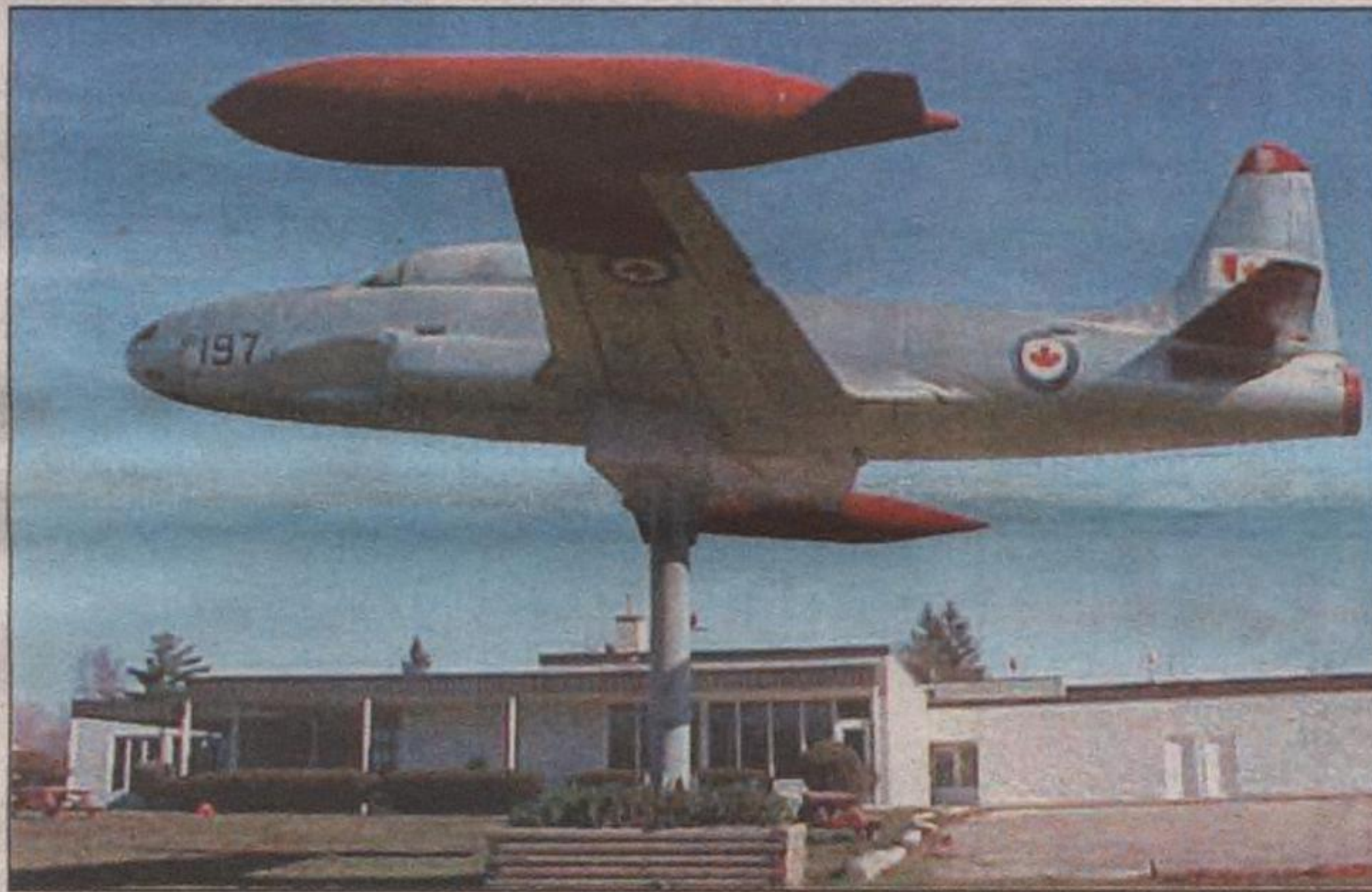
DAILY REMINDER: The fighter aircraft on display at BR. 197 Acton Legion simulates a flypast. Legion members will be honouring Vetrans on Saturday, November 11 at the Remembrance Parades.