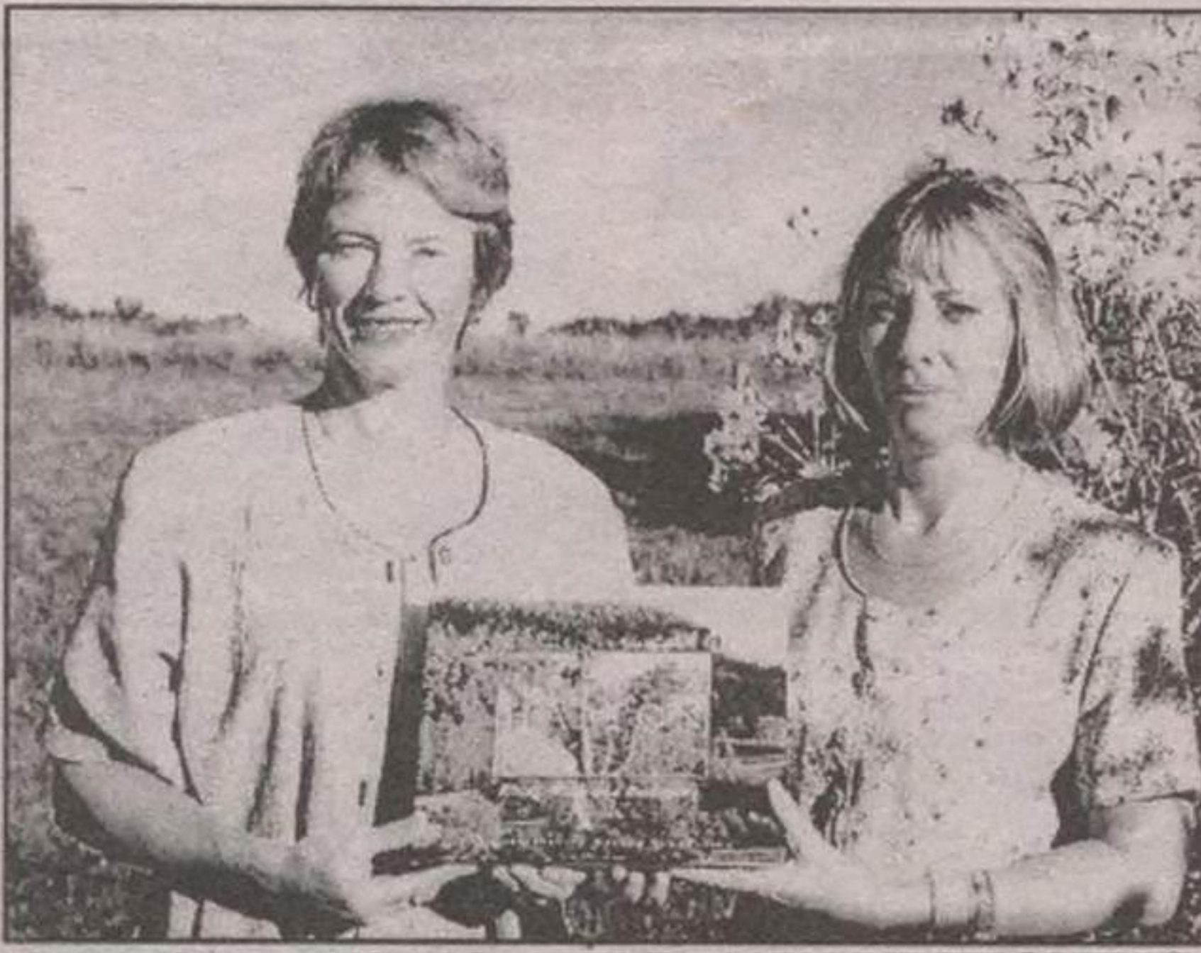
HALTON, RISING, WILD AND BECKONING: now on sale for $39.95 at bookstores throughout Halton region.