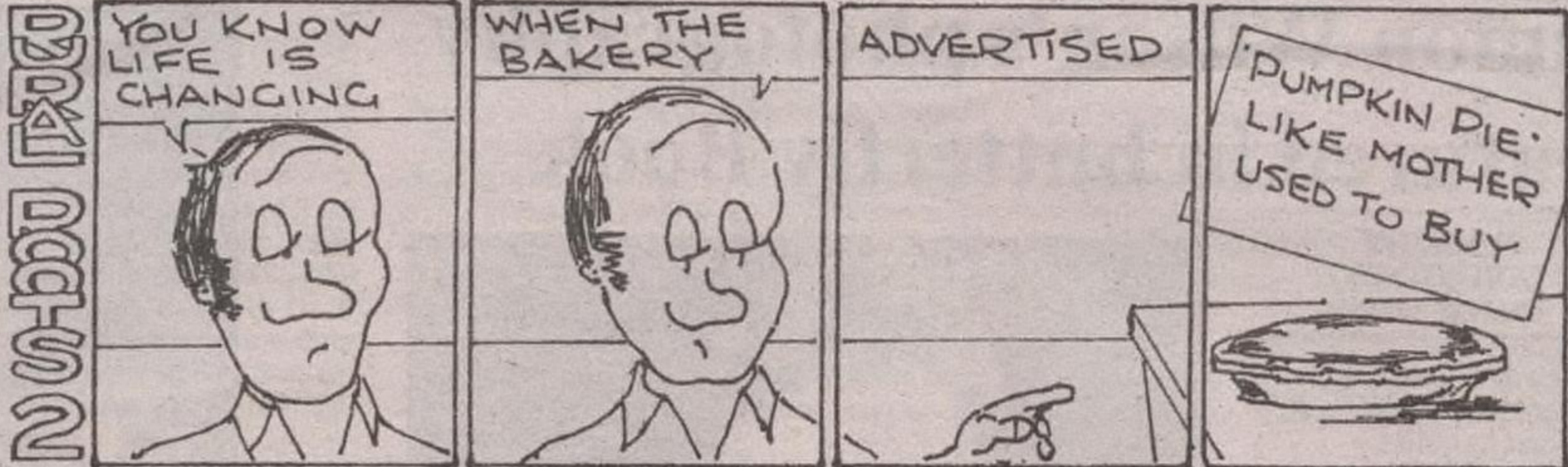
Jacy C. 2000

Plans to rezone a rural property on the south east corner of Highway 7 and 22 Side Road - Henderson's Corner - to permit commercial uses in an existing building four times larger than allowed in the Official Plan, drew objections from an area resident at a public planning meeting last week.