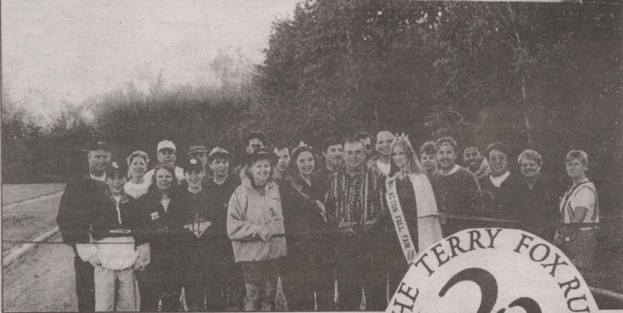
Last year's Terry Fox Run was a resounding success, over $ 25,000 was raised, a record. Shown here are officials starting off last year's event.