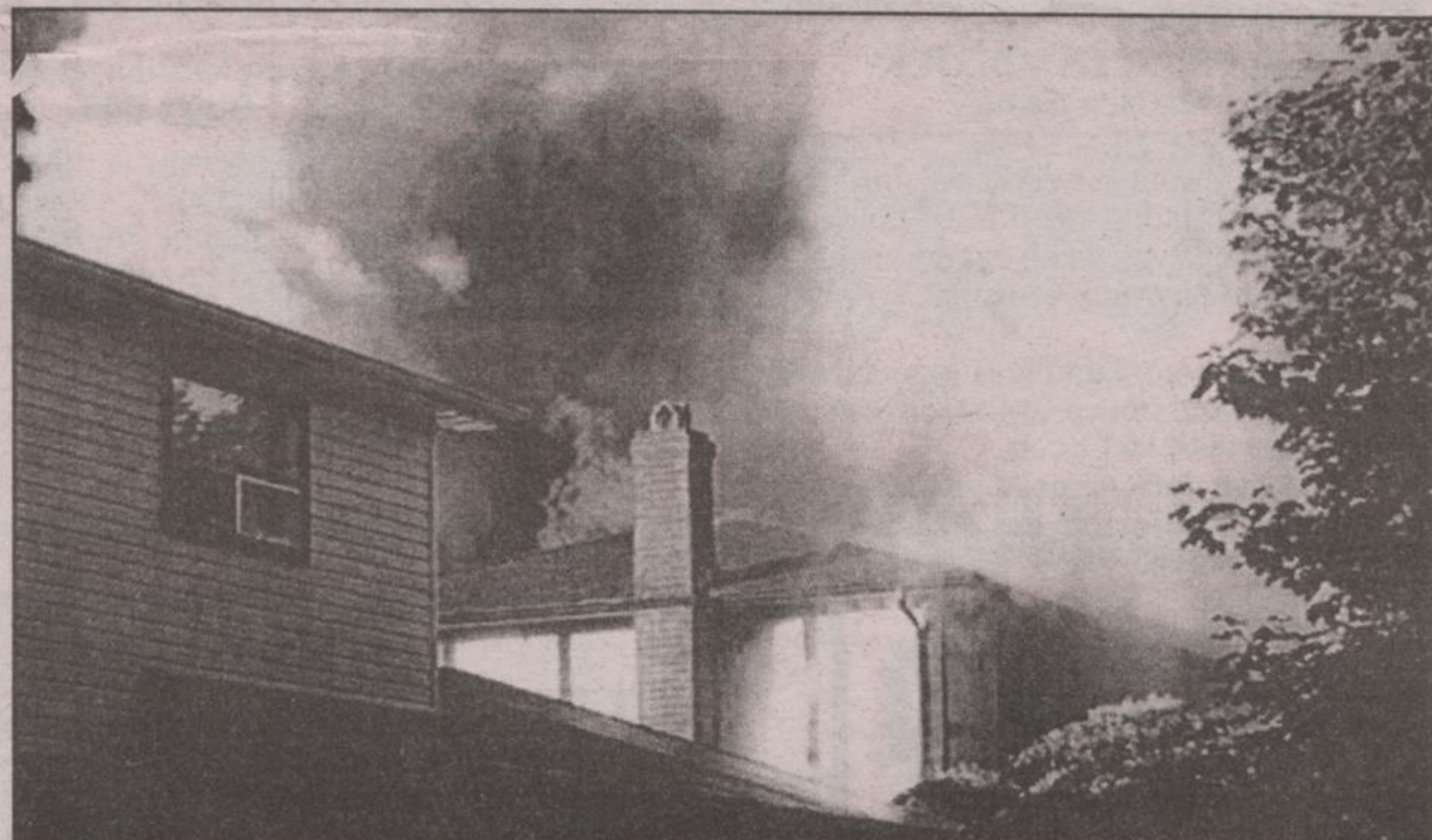
Flames break out of the roof of a Storey Drive home early Sunday morning sending plumes of black smoke into the air. The $150,000 fire has drawn suspicion of arson.

Police deny any intention of charging the girl's parents under the new Parental Responsibility Act. They have spoken to the girl and her family and found her to be crying, upset and remorseful.