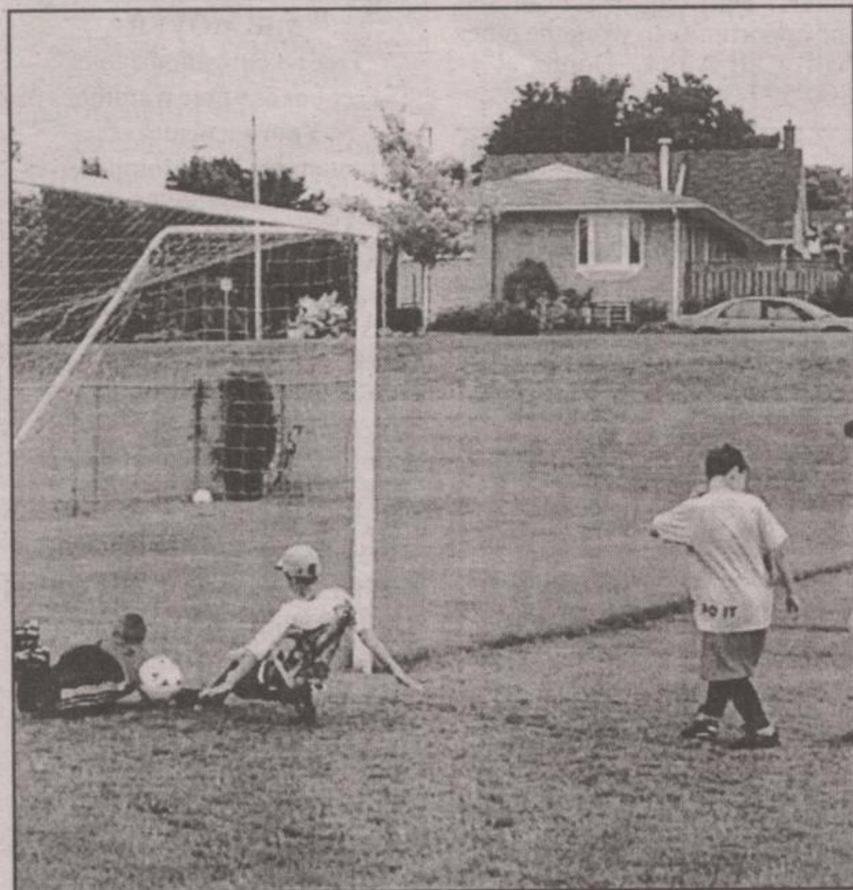
MAKING THE STOP: Acton Building Contractors players got in a little practice while they waited for the rest of their teammates.