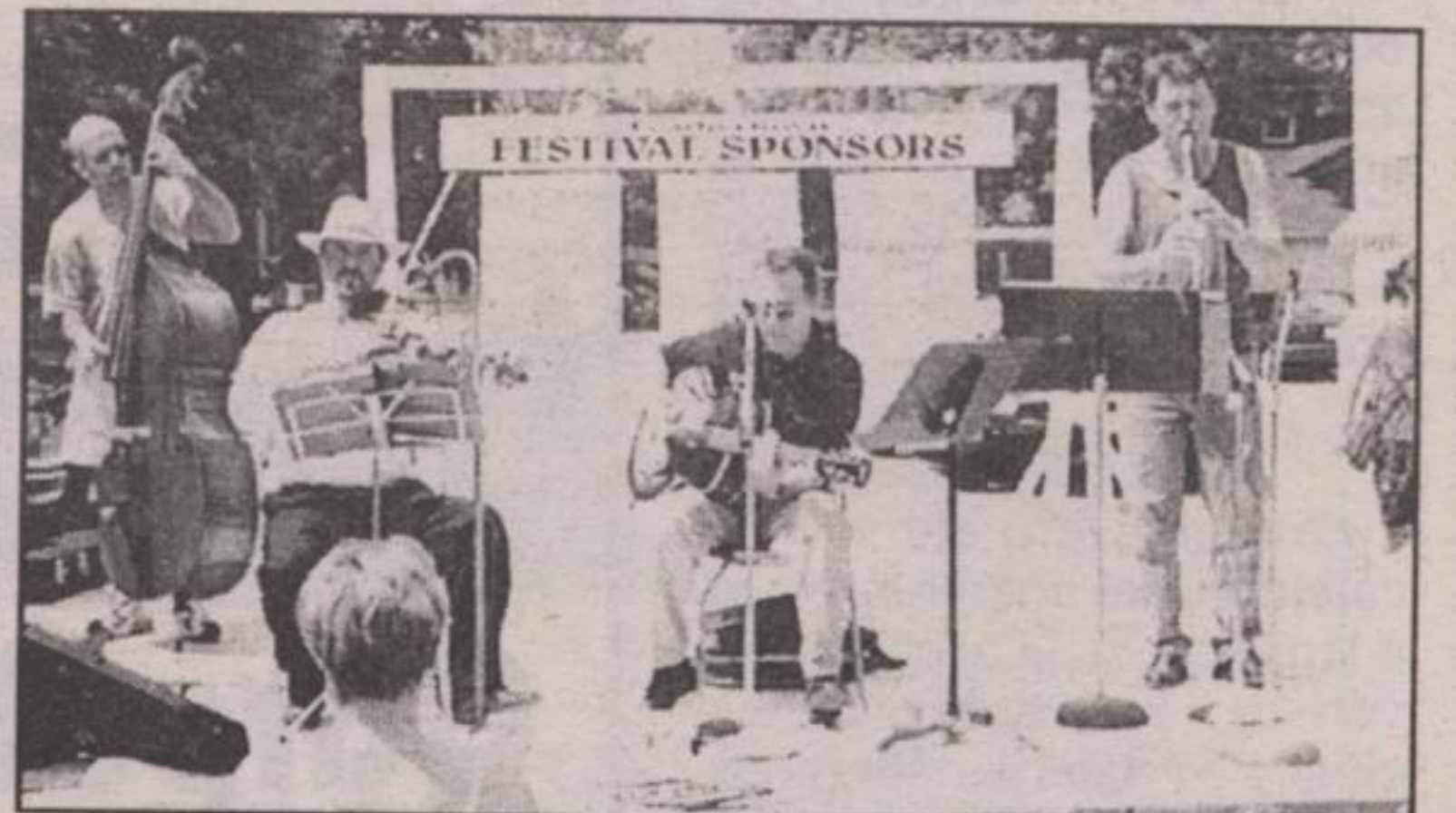
SWING SINGERS: The Bohemian Swing Band had the crowds tapping their toes and singing along as they entertained during Sunday's festival.