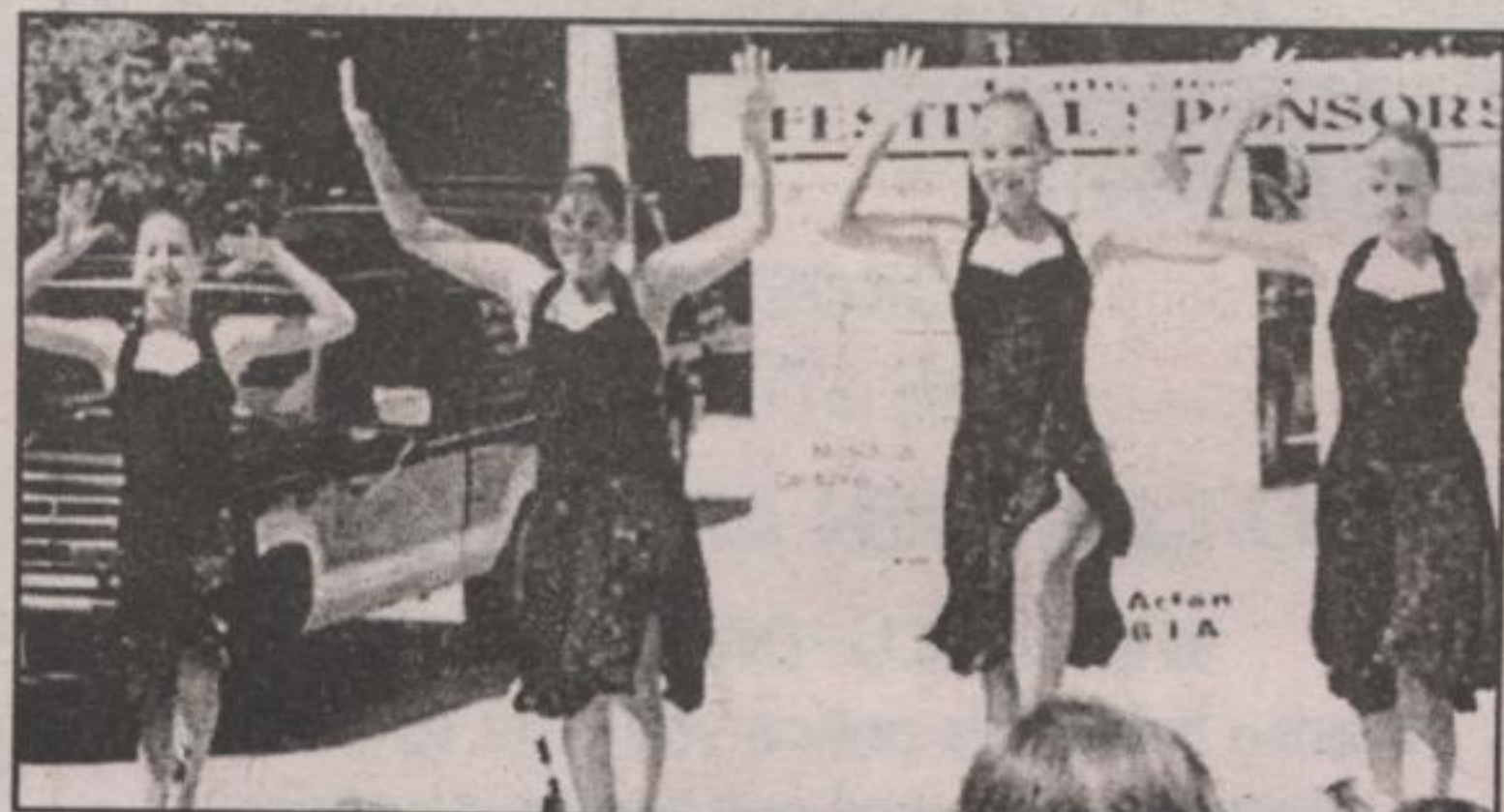
SWING SISTERS: The crowds at Sunday's Leathertown Festival loved this Zoot Suit Riot number by members of the Georgetown Dance Company.