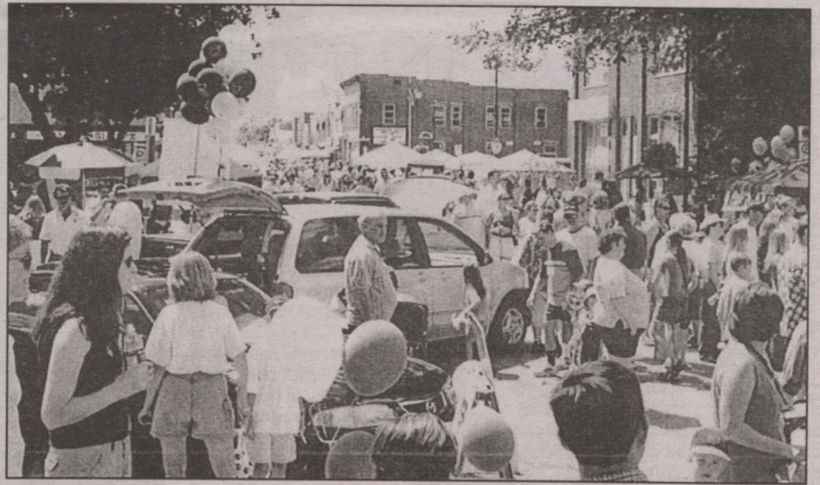
BLOCKS OF FUN: As many as 7,000 thronged through downtown Acton on Sunday - enjoying great weather, good food and lots of fun - during the 9th annual Acton BIA Leathertown Festival. Organizers said this year's event was the best ever in terms of the crowd and the number of vendors.