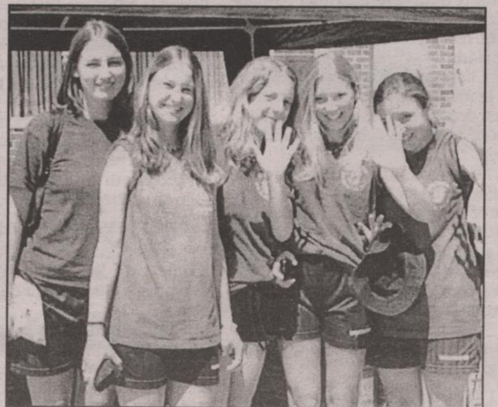
SIDEWALK SHOPPERS: This group of friends from southeast England shopped up and down Mill Street during Sunday's Leathertown Festival. The girls head home today (Thursday) after attending the 6th annual Polish Scouting World Jamboree.