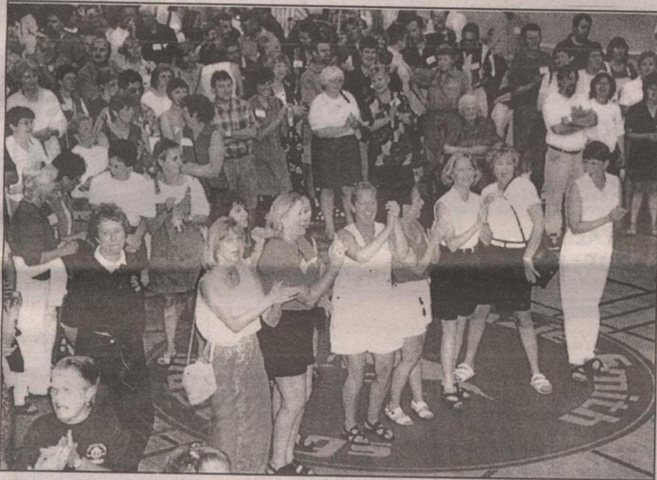
WASN'T THAT A PARTY!: The gym was full Saturday when the reunion's opening assembly kicked off. Above, the crowd reacted to the nostalgic sounds of a present-day high school trio playing an Elvis Presley tune.

'One of the biggest, best Acton ever had!'