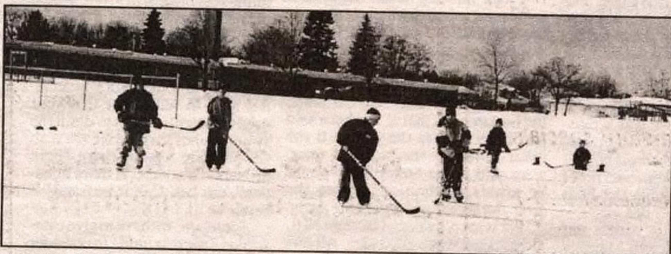
MORNING EXERCISE: Youngsters of all ages took their turn on the ice at the outdoor rink behind McKenzie-Smith Bennett Middle school Saturday.