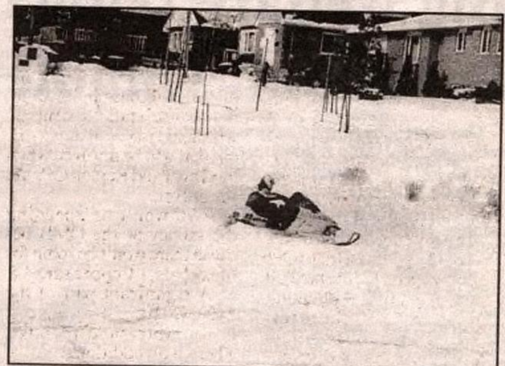
SNOW SPRAY: Another great way to spend a chilly afternoon was enjoyed by this snowmobiler on Fairy Lake on Saturday.