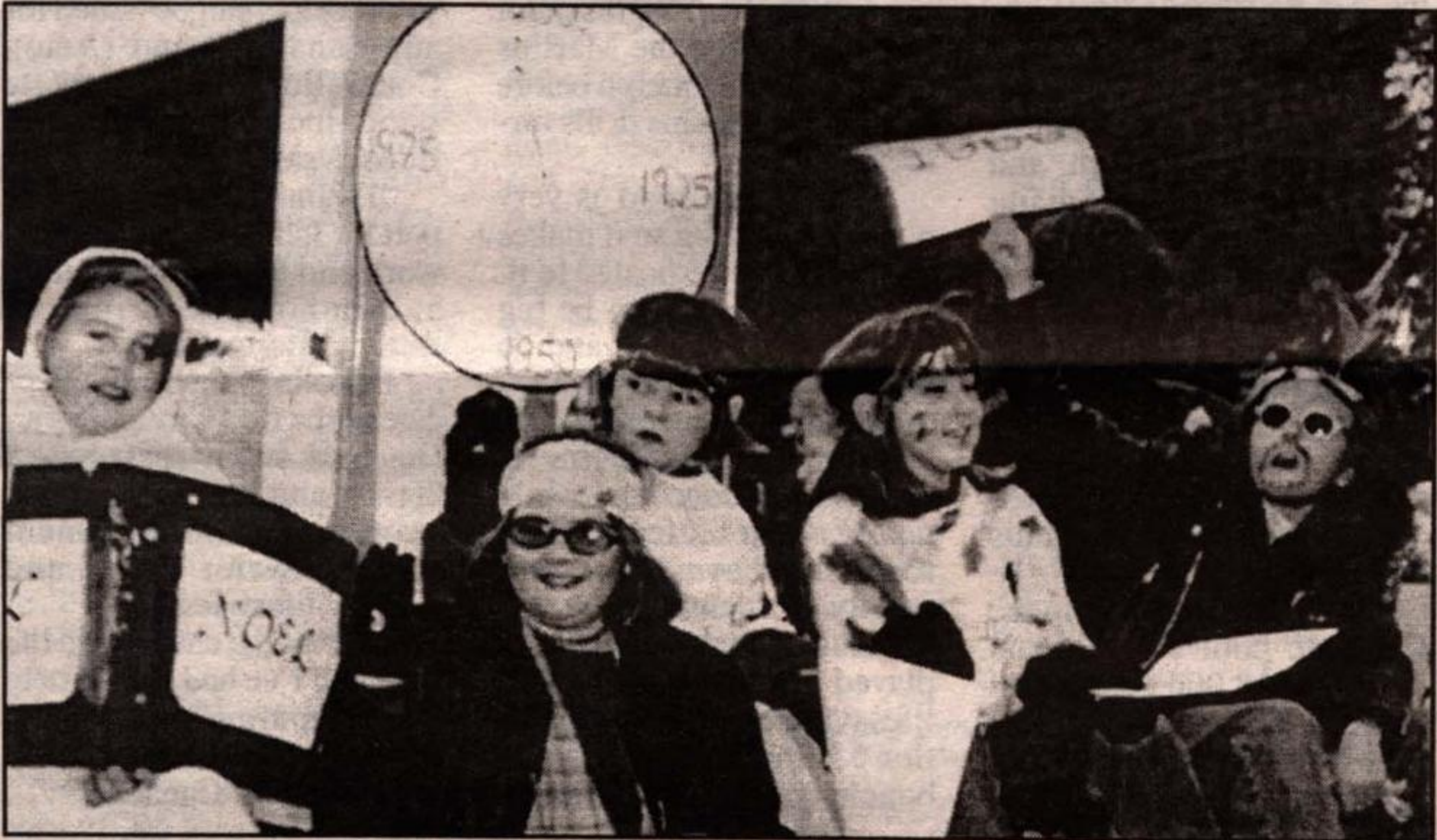
HIPPY CHICKS: Students from St. Joseph's school took top prize in the parade with their time line float. Below, a full size view of St. Joseph's winning float.