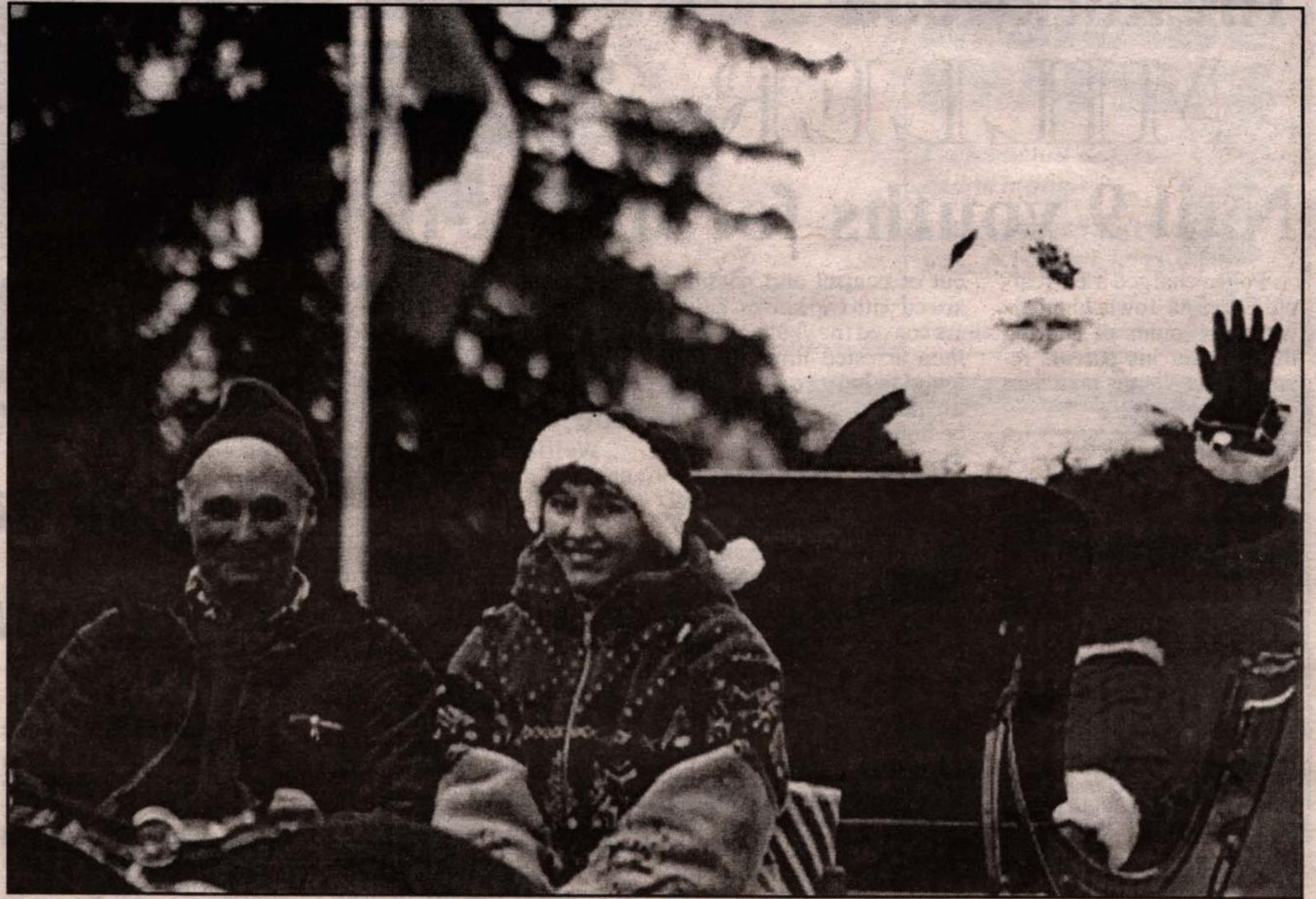
LAST STOP BEFORE THE BIG DAY?? Santa Claus and some of his helpers dropped in to Acton last Saturday as the grand finale of the parade. Just think, only one month until Santa's busiest day of the year.