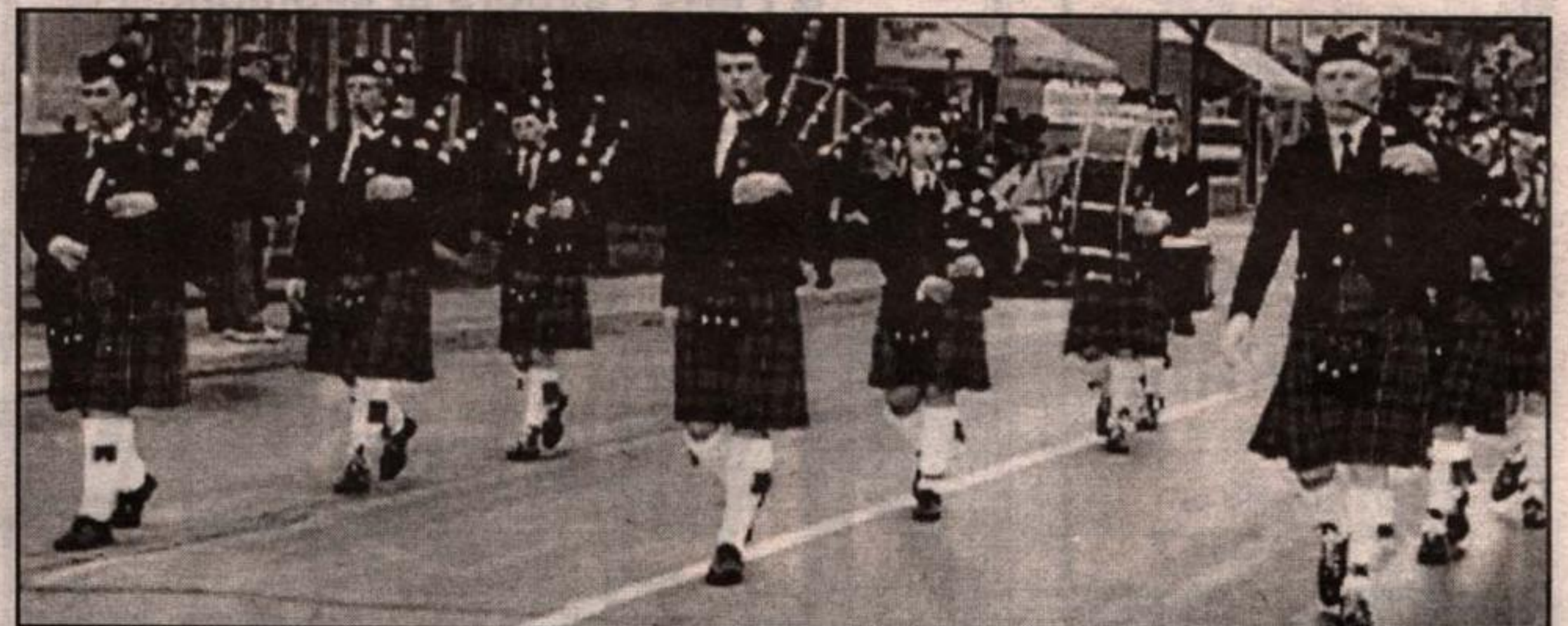
PRICELESS PIPERS: A parade wouldn't be complete without a pipe and drum band.