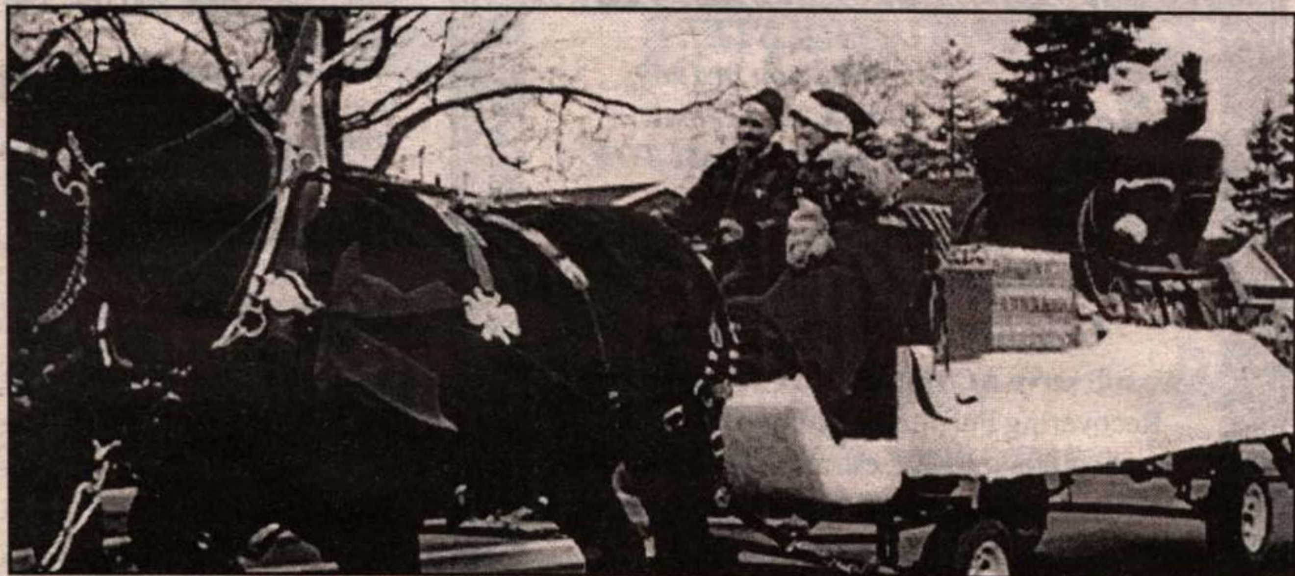
DRIVING IN STYLE: Santa passed through Acton in style with a horse-drawn sleigh. The reindeers must have stayed at the North Pole to rest up for December 24th.