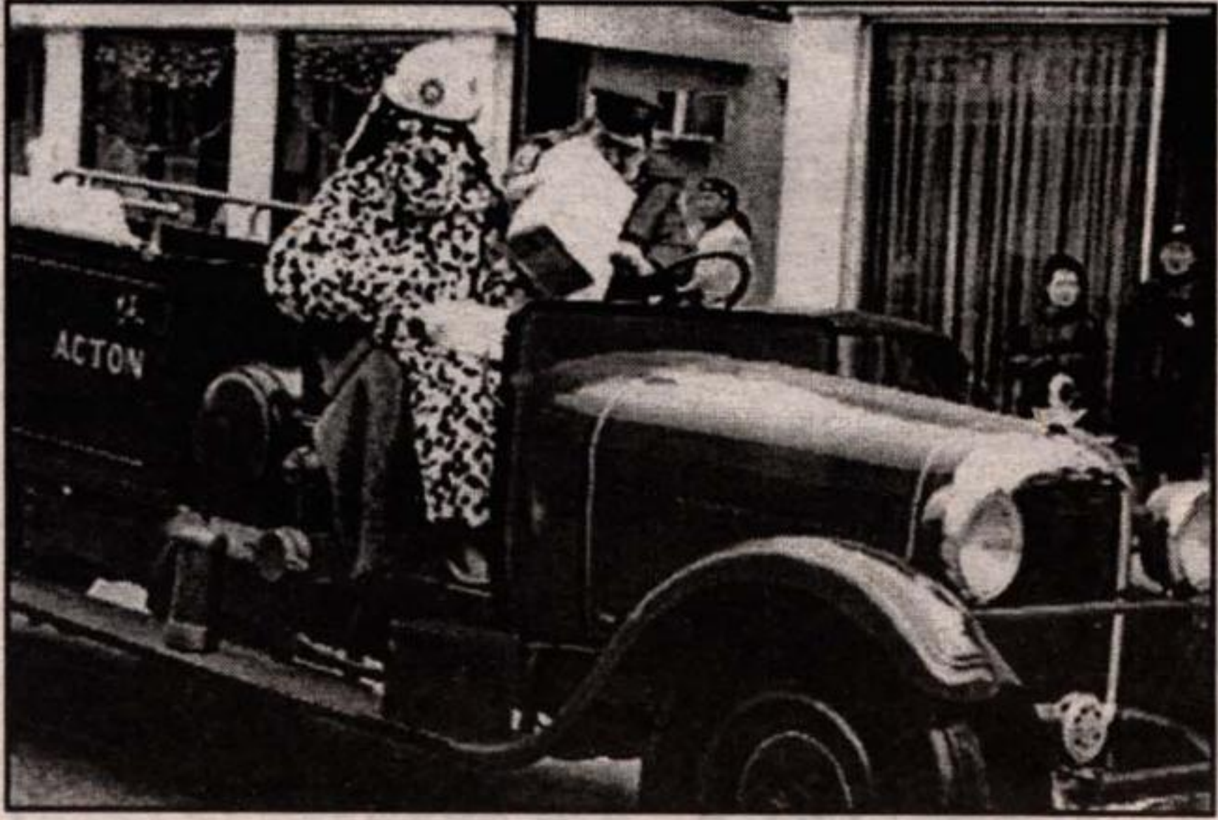
FIRE SAFETY FRIEND: Sparky the Fire Safety Dog sits aboard a vintage fire truck.