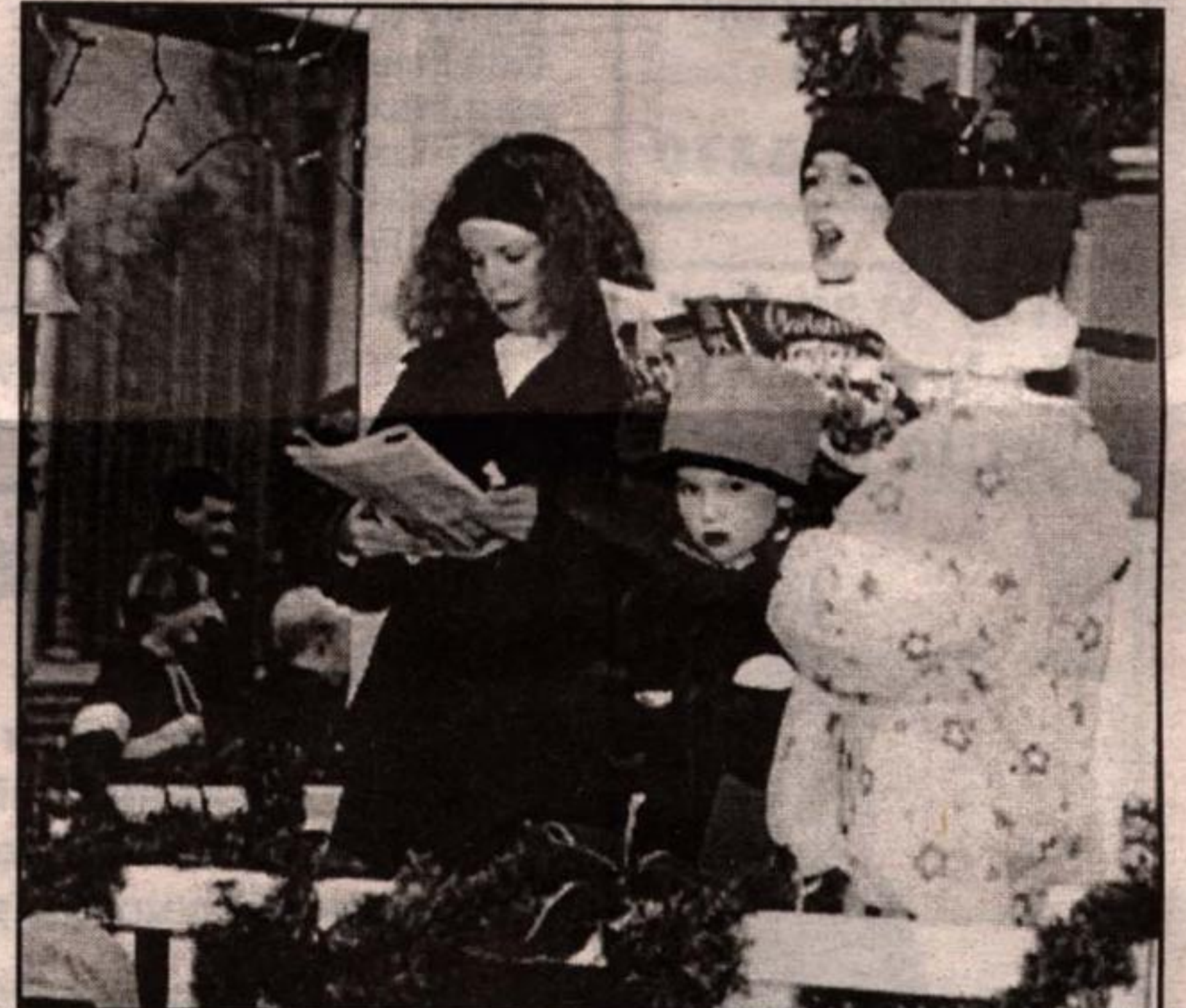
CAROLLING KIDS: Friends and family of Peter Zions Construction sang old fashioned carols during the parade.