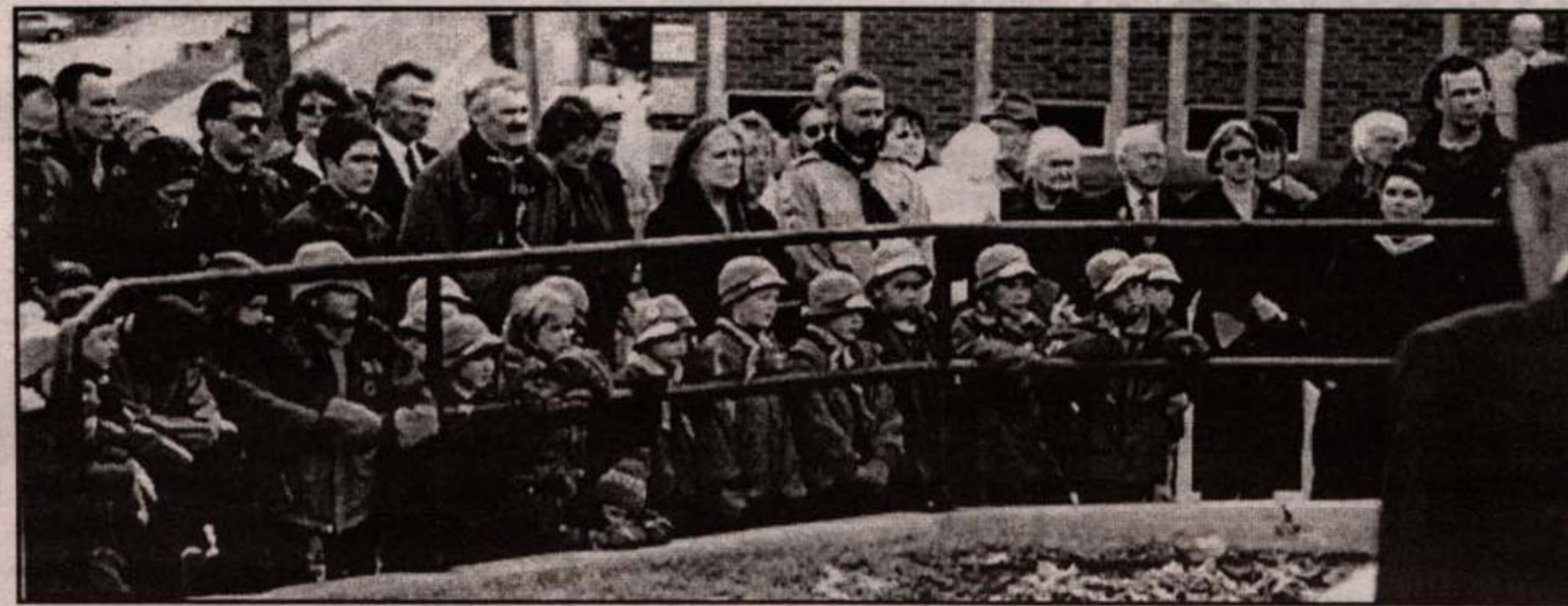
SOLEMN SERVICE: Members of Rockwood's Beaver Colony got front row places as area residents surrounded the cenotaph for Sunday's Remembrance Day service.