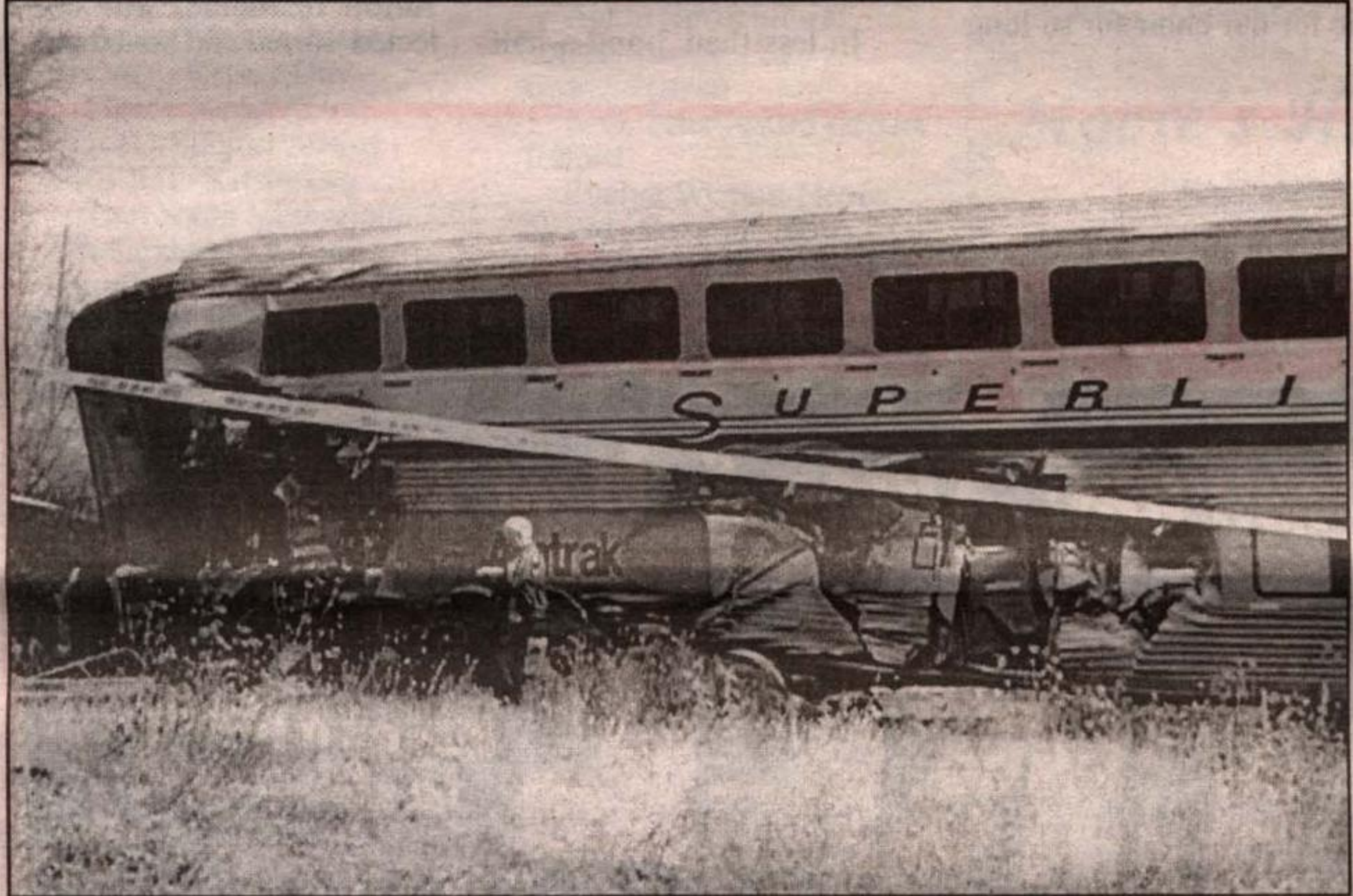
The first coach suffered a gaping hole in the crash. The truck, driven by a man from Little Current, collided with the Amtrak train at the Fourth Line crossing. Fortunately all the passengers had been moved to the two rear coaches because of a malfunctioning air conditioning system.