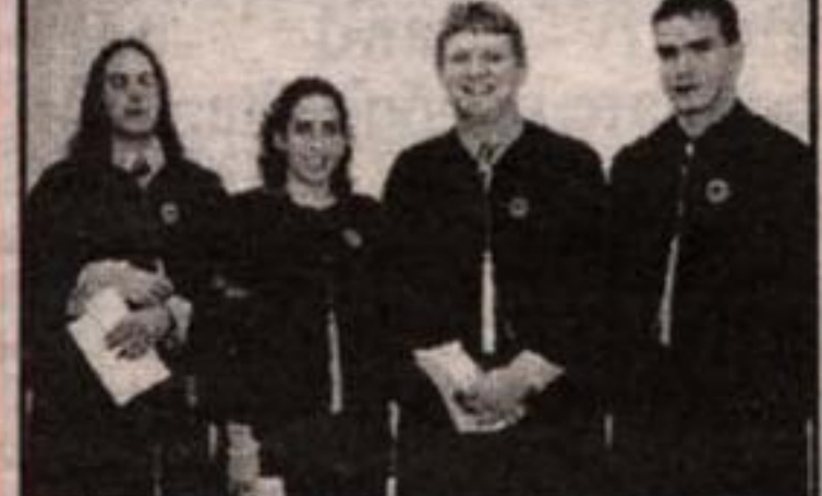
Acton High School honoured its graduates at ceremonies in the school Friday night. See Page 3.