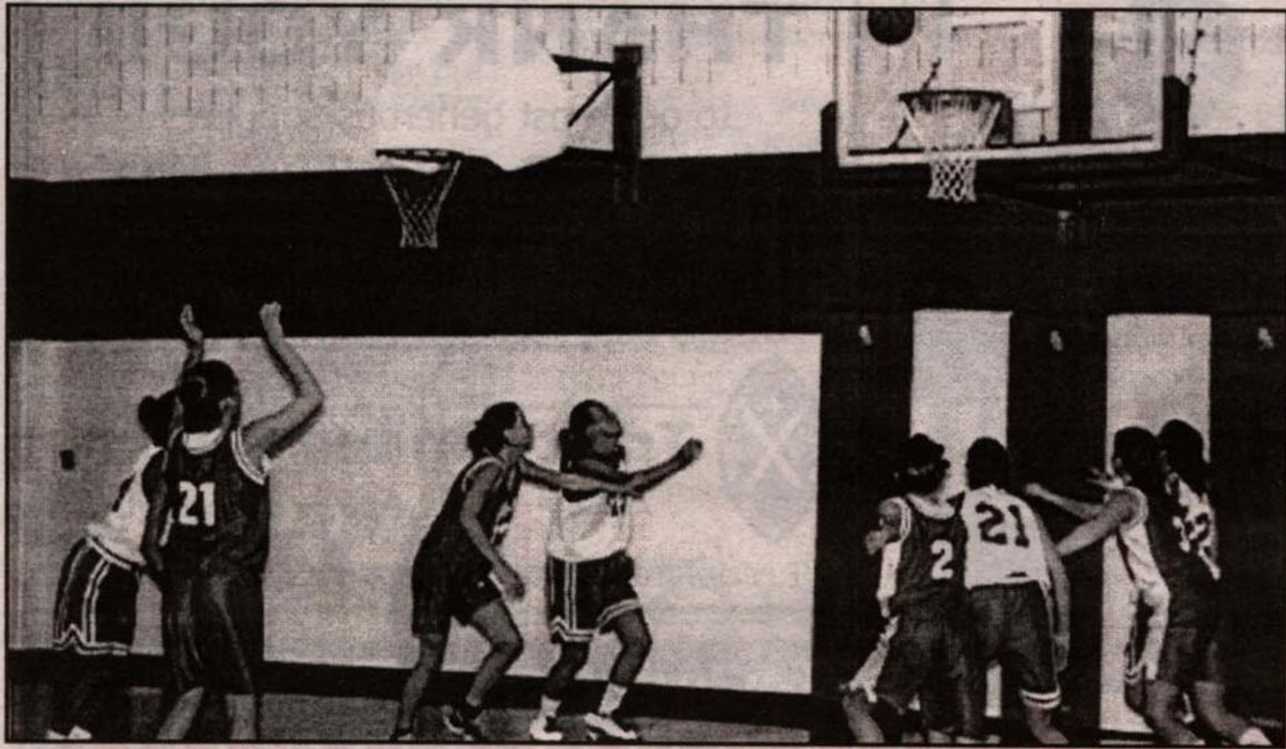
PENALTY SHOT: Acton junior girls scored on a penalty shot during their Saturday morning game at Acton High school against players from Burlington's Pearson High school. Despite good marksmen Acton lost 26 to 37.