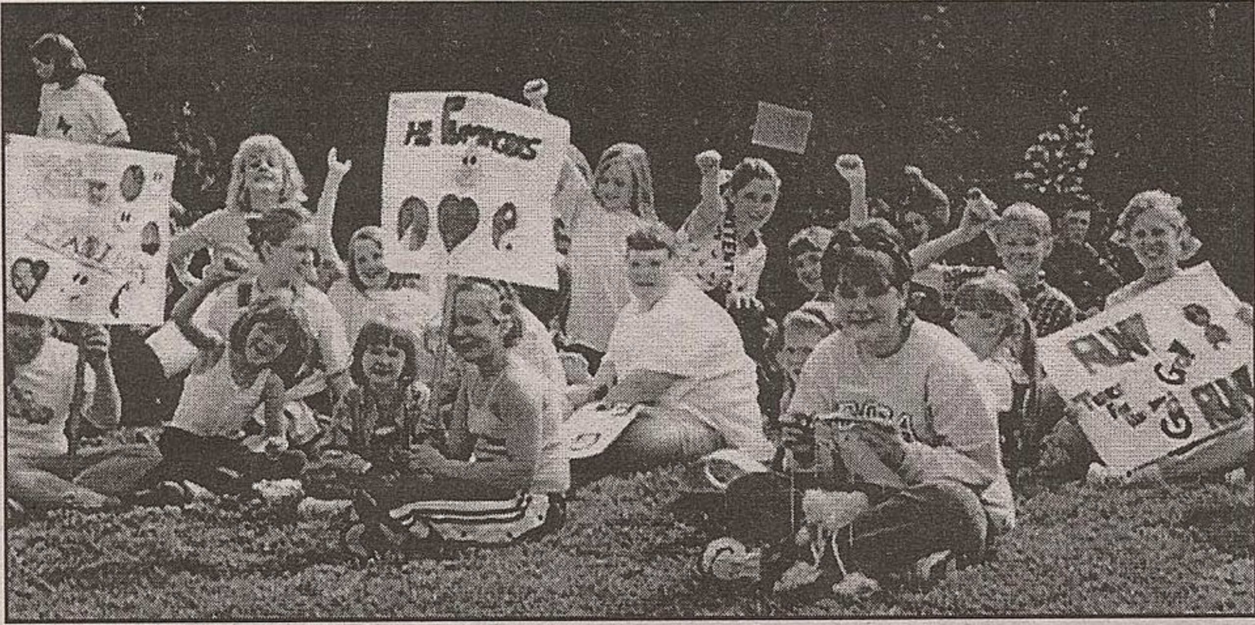
YELLOW RULES: Members of the Yellow team prepare to take part in the school's Terry Fox Run event on Monday.