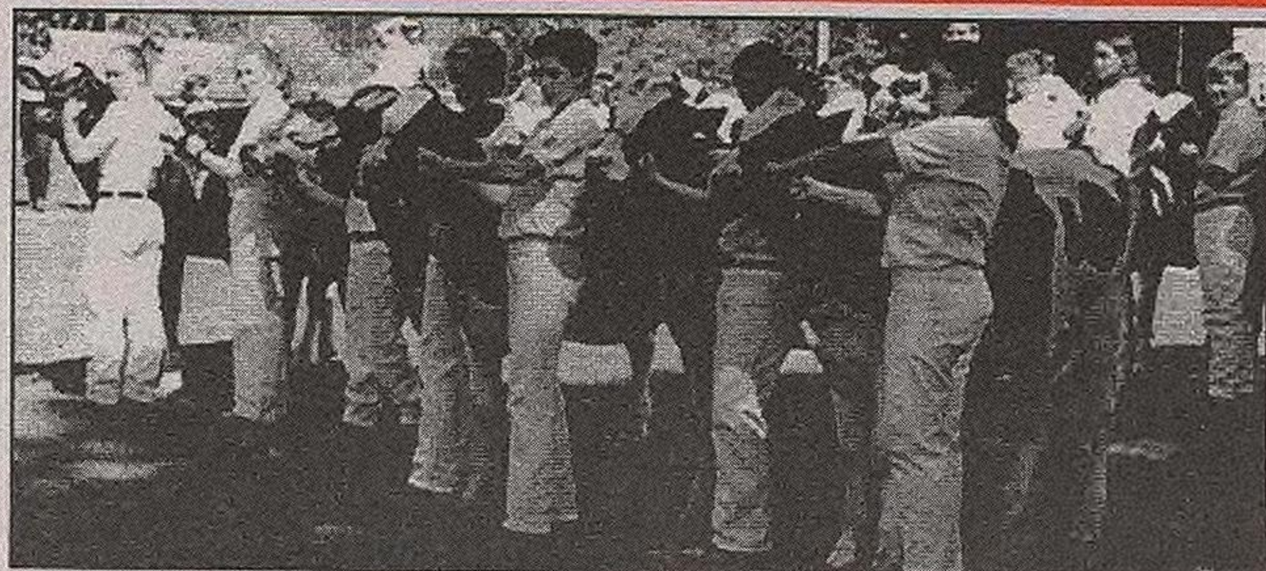
Livestock exhibitors strut their stuff for the fall fair judges.