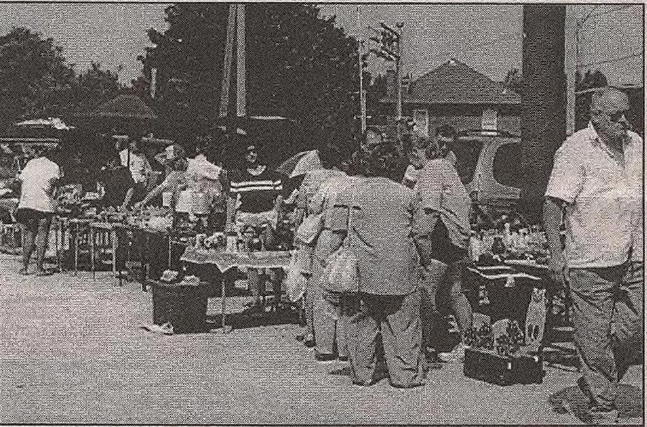
WELL HOUSE: Holiday home must be over because Saturday's Trunk Sale had the most vendors so far this year. More than 60 vendors filled all the spots and had to create a few extra ones.