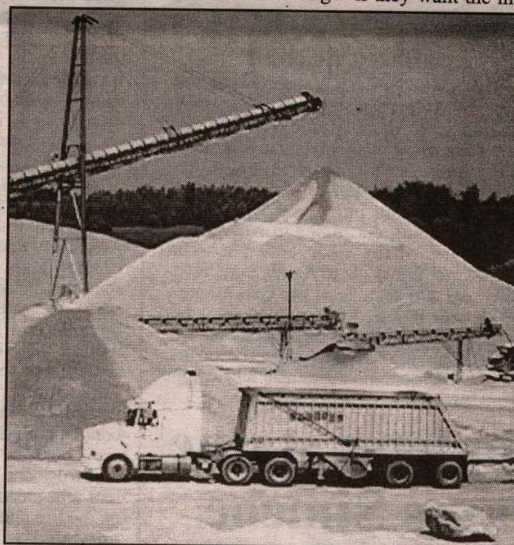
WAITING HIS TURN: A trucker waits his turn to be loaded at Blue Circle's Acton quarry.

For information phone the Centre at 853-5951.