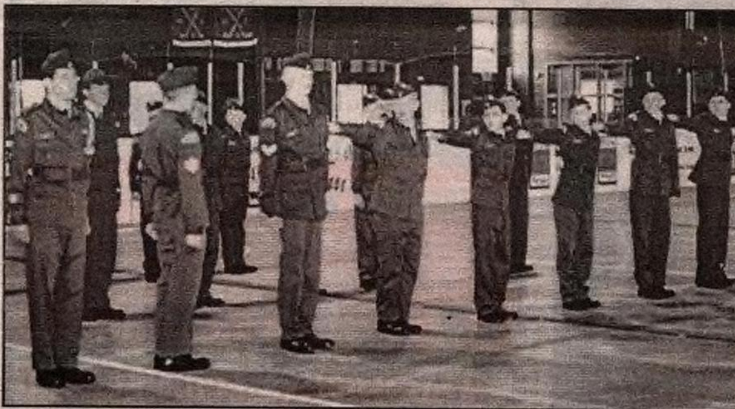
DRESS RIGHT! Members of the 197 Typhoon Squadron tidy up their ranks in preparation for their annual inspection. After the inspection the 35 cadets - all spit and polish - showed their proud parents what they'd accomplished during a very busy year.

The squadron will hold a recruitment drive in Acton schools this September. Air Cadets is open to youths aged 12 to 19.