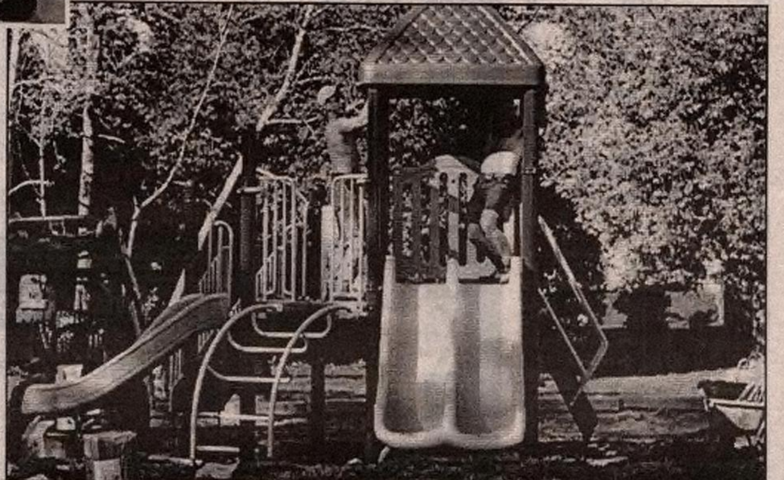
SPRING FUN: Kids living near Bovis Park off Wallace Street can now enjoy the new playground equipment, including two slides, a jungle gym, a covered play area and more. Town works crews removed the old worn-out wooden climber recently. Total cost of the project is $18,000.