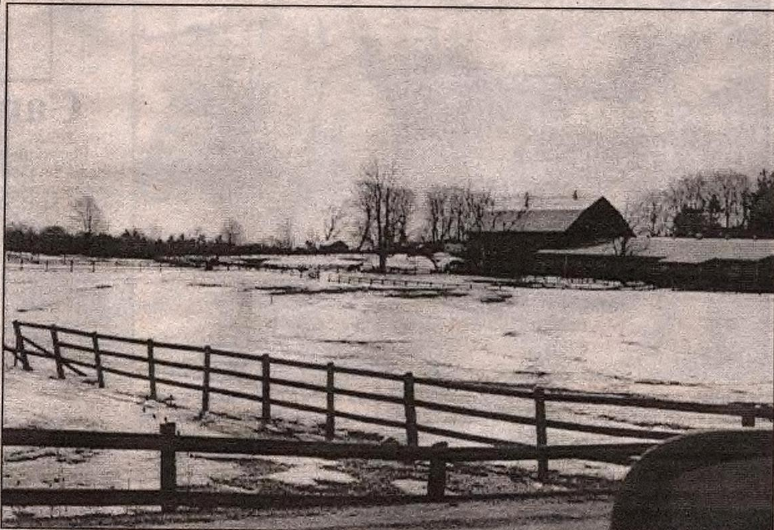
The warm spring sun is gradually eroding snow caps in fields such as this one at a horse farm at Limehouse. Spring arrived Sunday and the weatherman is promising warm days. Glory. Glory. Hallelujah!