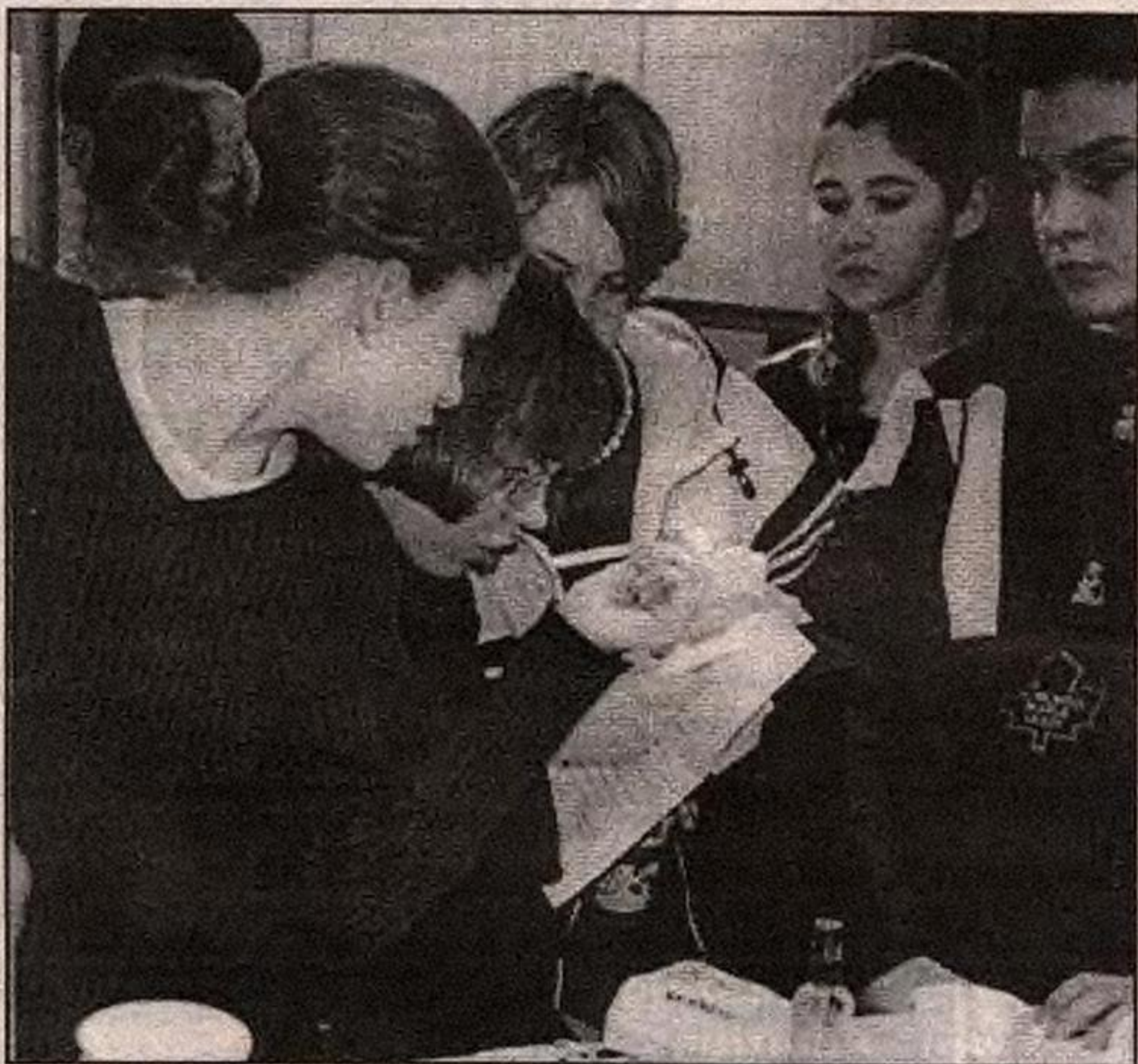
CHECKING: Members of Acton Baptist Church Youth Group, the Garbonzo, check out their list of scavenger hunt items during their fundraising 30 Hour Famine for World Vision last weekend. The group raised about $2,000 for their project.