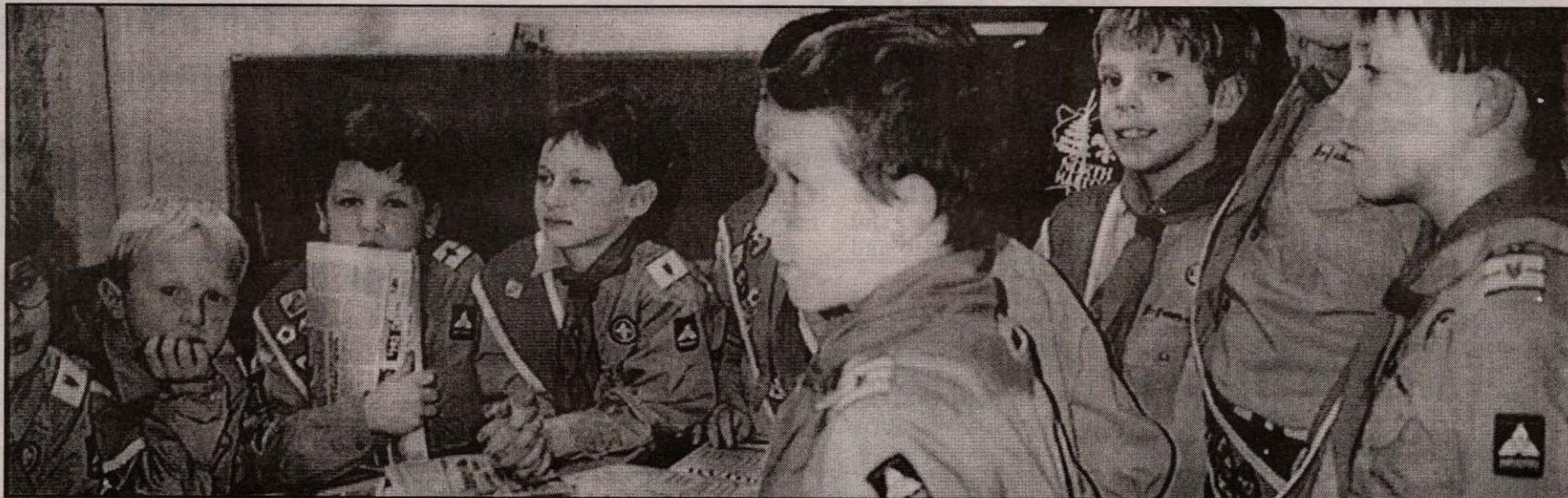
CUB REPORTERS: Members of the 1st Limehouse Cub Pack visited The New Tanner to find out how a newspaper gets put together and also to learn how computers are used in business.