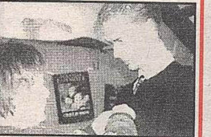
Acton High School's annual commencement last Friday honored 92 students who received their diplomas. See story page 11.

Next week's New Tanner will be published Tuesday, Dec. 29.