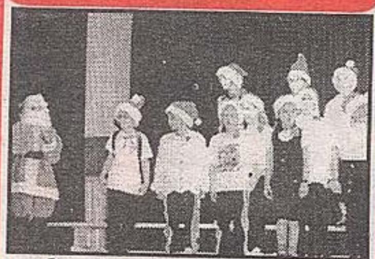
Students at Robert Little school delighted audiences with their Christmas concert. See photo on page 3