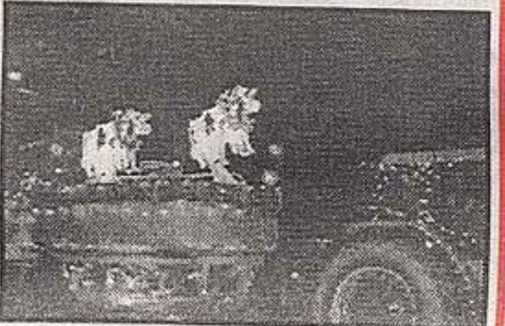
Rockwood annual Parade of Lights drew more than last year's 7,000 people to watch this year's parade. See photo page 13.