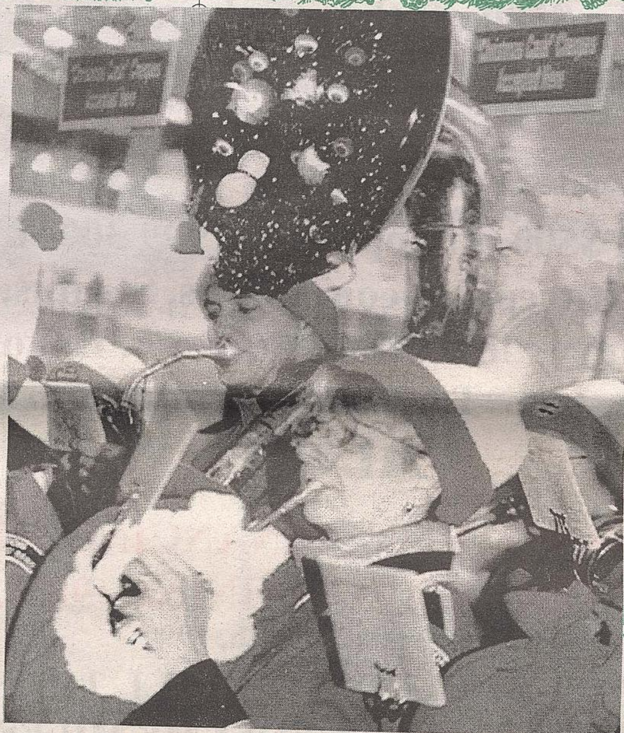
ANNUAL TRADITION: Wednesday evening many Acton residents were treated to Christmas carols when The Acton Citizens' Band played around the town.