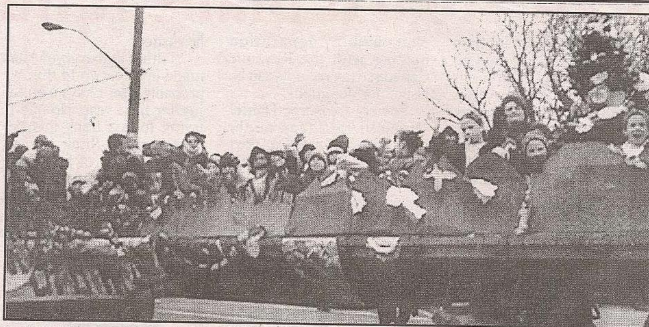
WINNING FLOAT: Pupils at St. Joseph's school decorated their winning float around a Peter Pan theme.